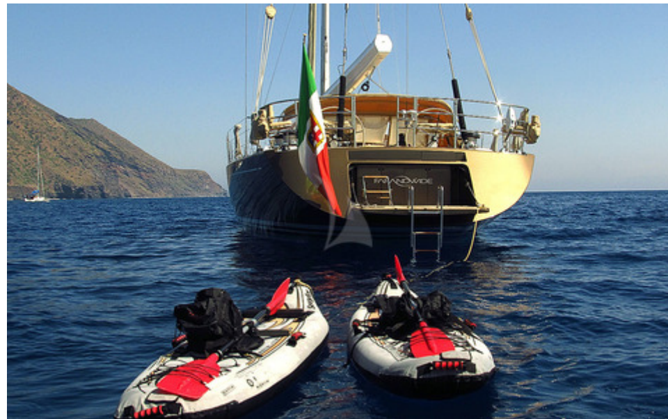
Some water toys