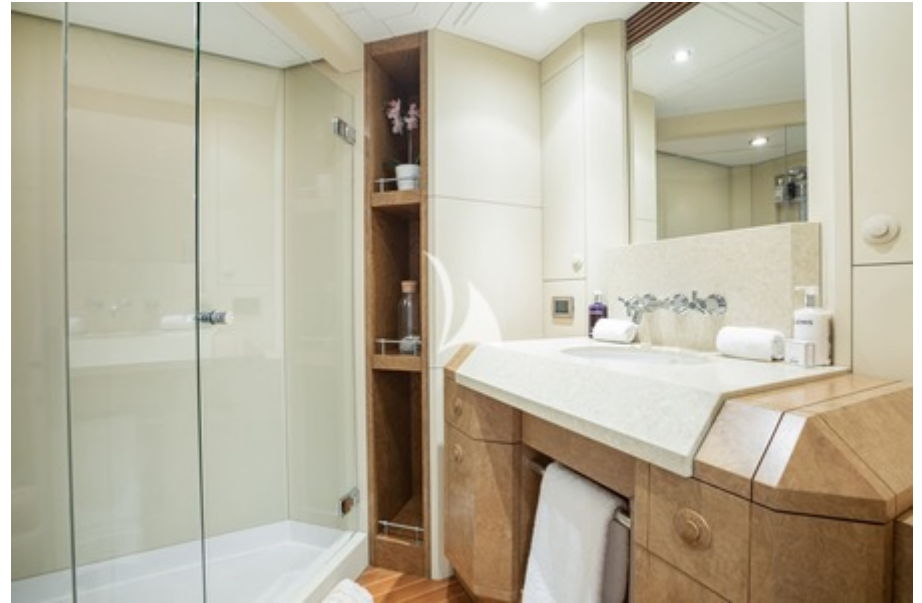
En suite bathroom