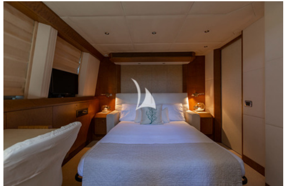
Office converted to double cabin