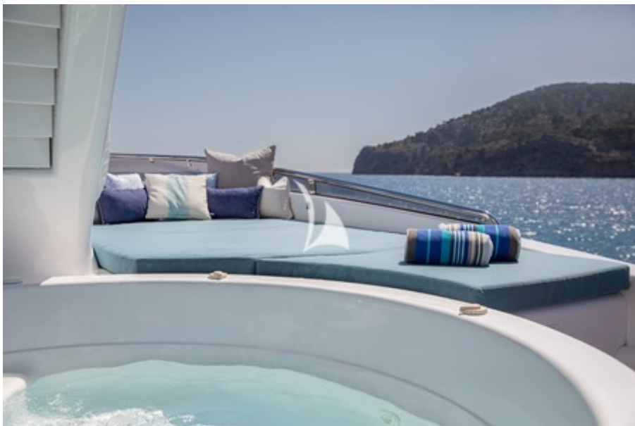
Jacuzzi on Flybridge