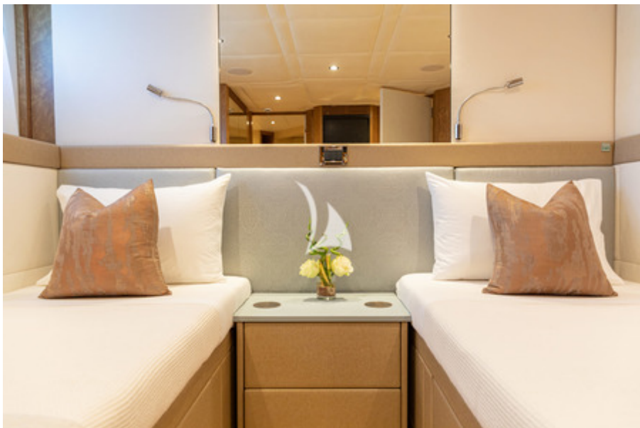
Twin cabin convertible to double