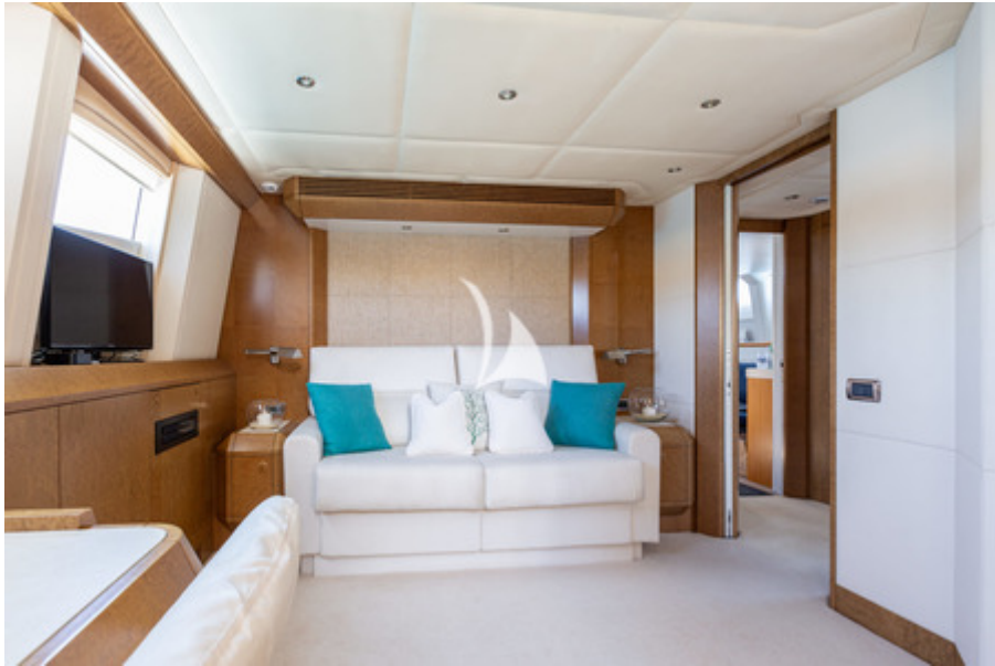
Office on main deck