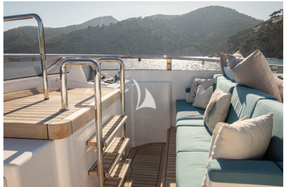
Cockpit on Flybridge