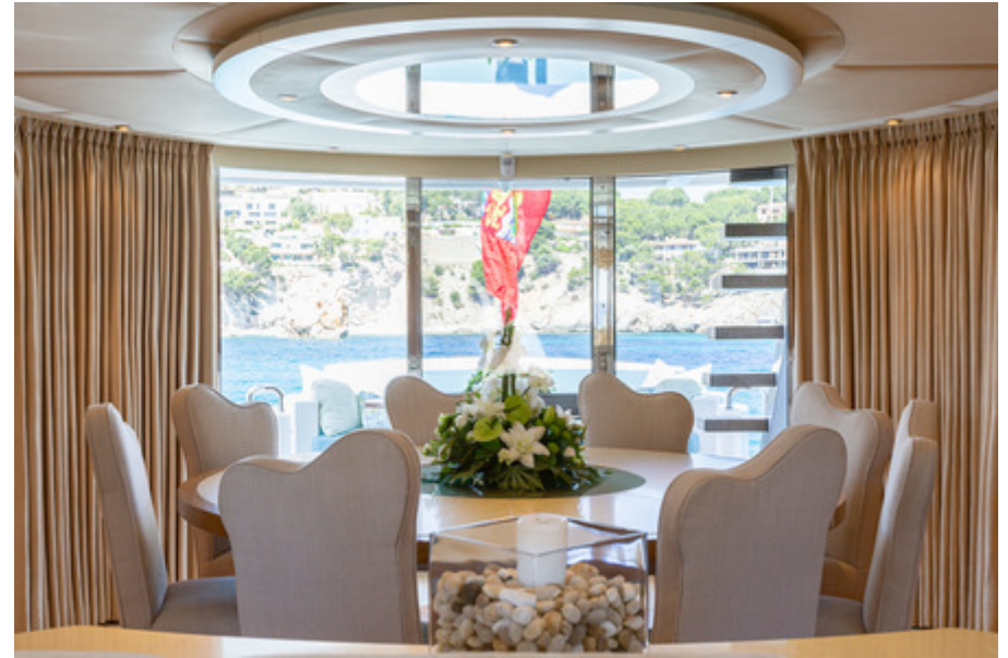
Interior dining table