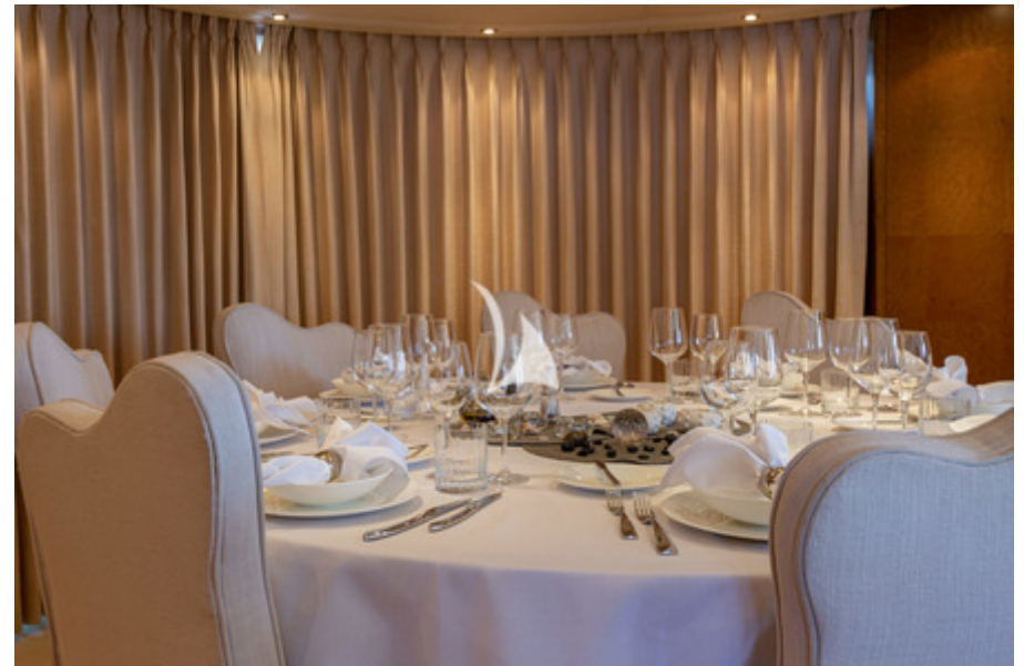
Interior dining table