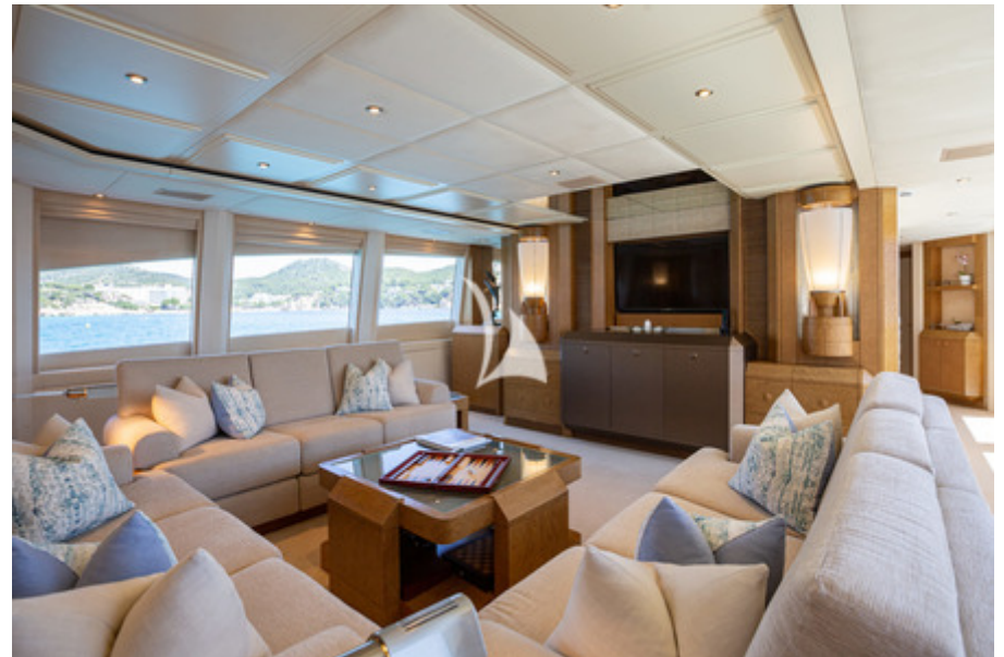
Main Deck salon