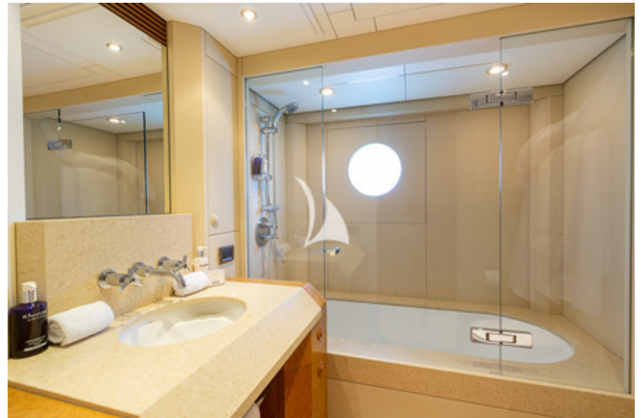
En suite bathroom