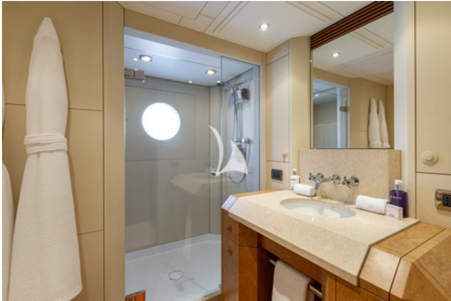
En suite bathroom