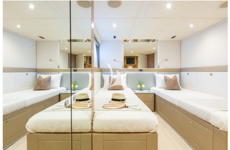
Twin cabin convertible to double