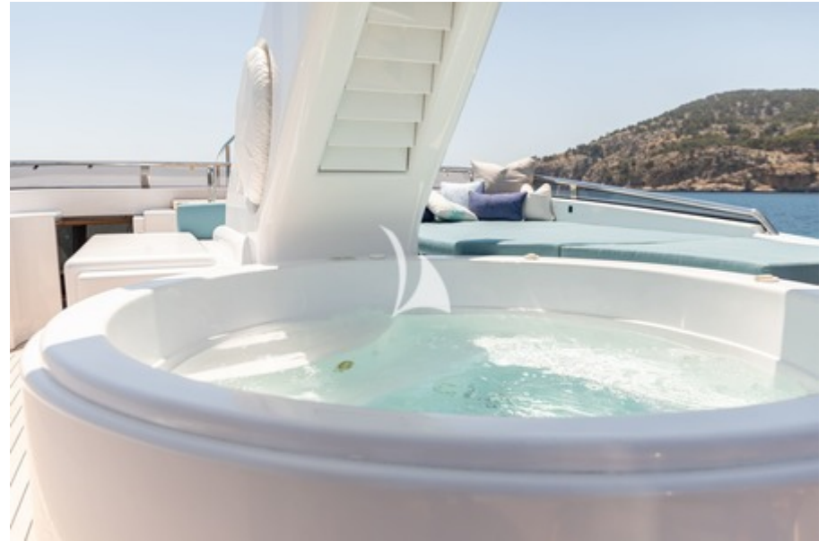
Jacuzzi on Flybridge