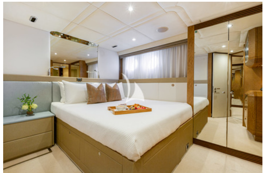
Twin cabin convertible to double