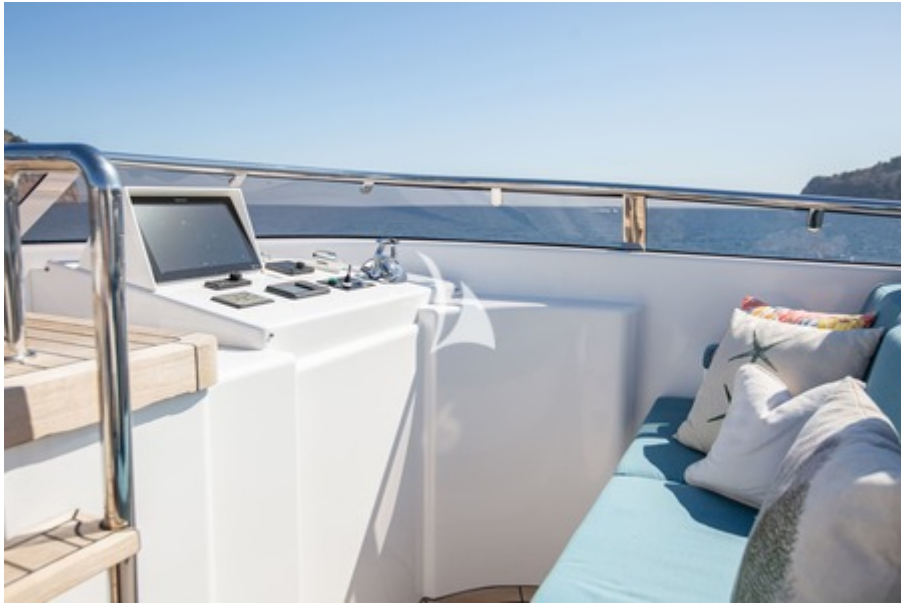
Cockpit on Flybridge