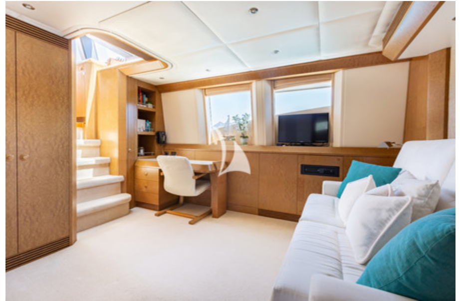
Office on maindeck