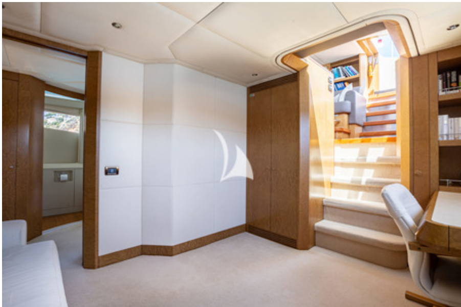
Office on maindeck