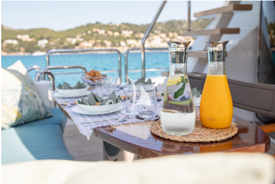
Aft Deck detailing