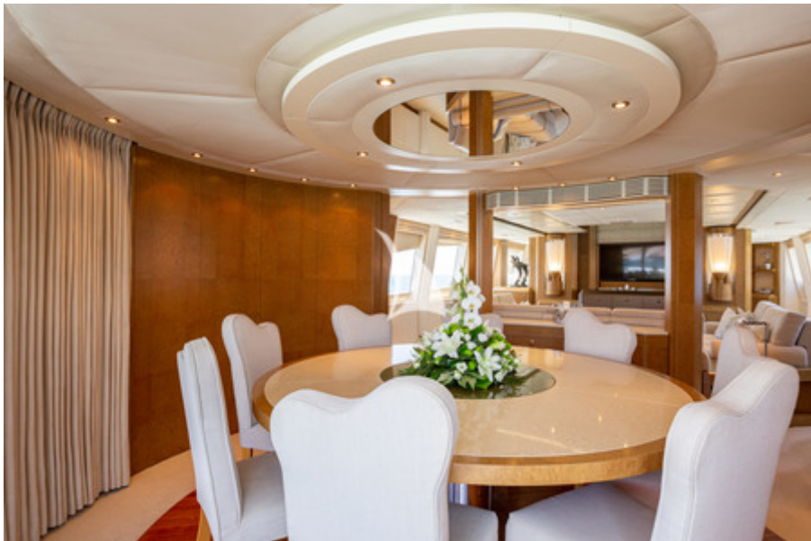
Interior Dining table