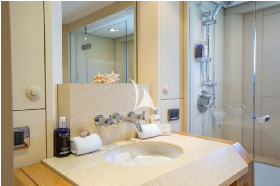
En suite bathroom