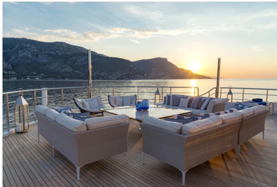
Serenity Outdoor Sitting Area