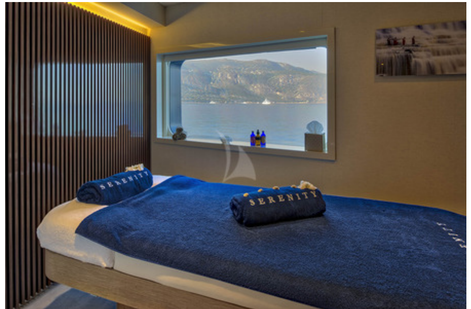
Serenity Spa Area