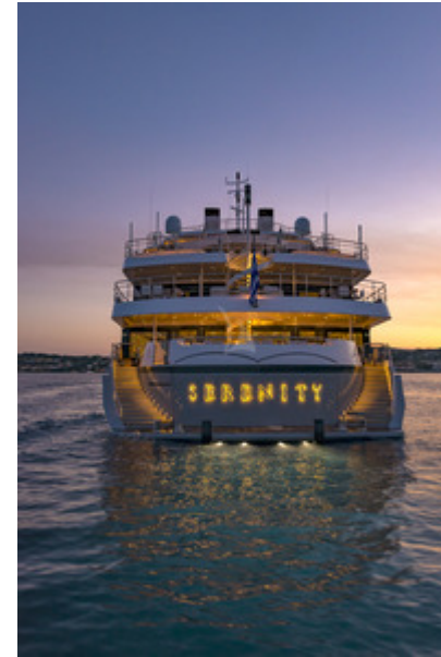
Serenity at Night