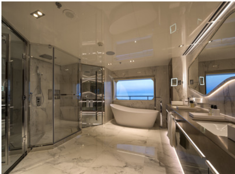
Serenity Owner's Bathroom