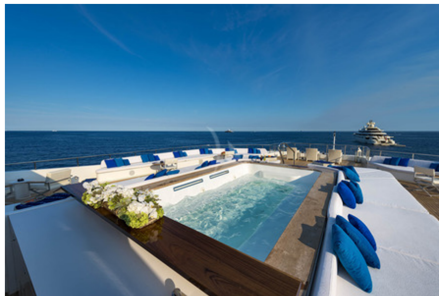
Serenity Pool Area