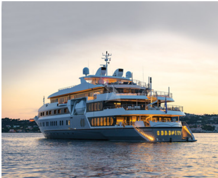
Serenity at Night