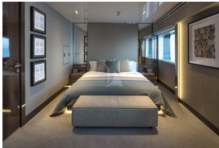
Serenity VIP Cabin