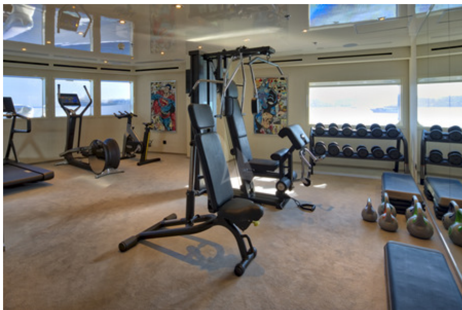
Serenity Gym Area