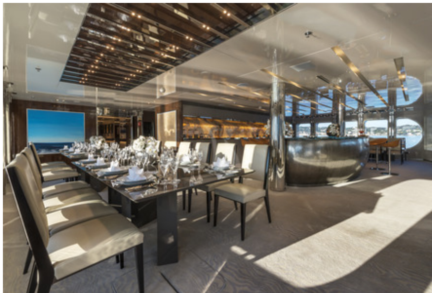
Serenity Dining Area