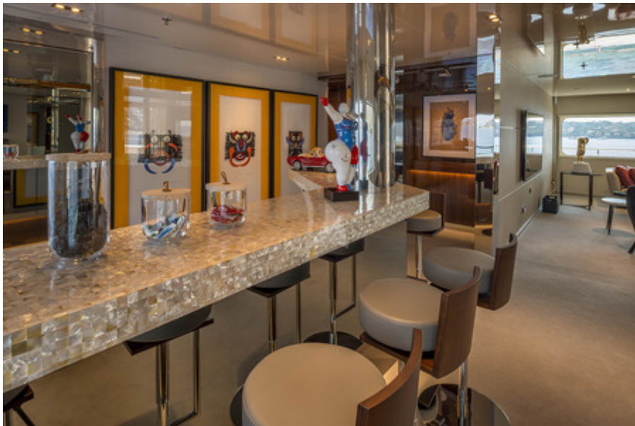
Serenity Owner's Lounge