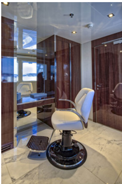
Serenity Beauty Salon