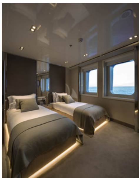
Serenity Twin Cabin