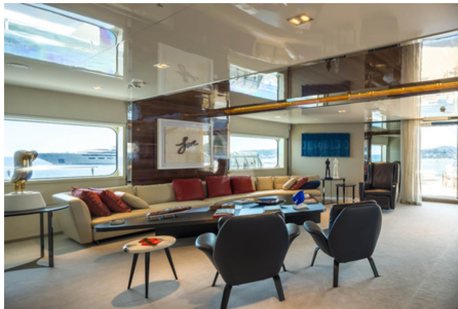
Serenity Owner's Lounge