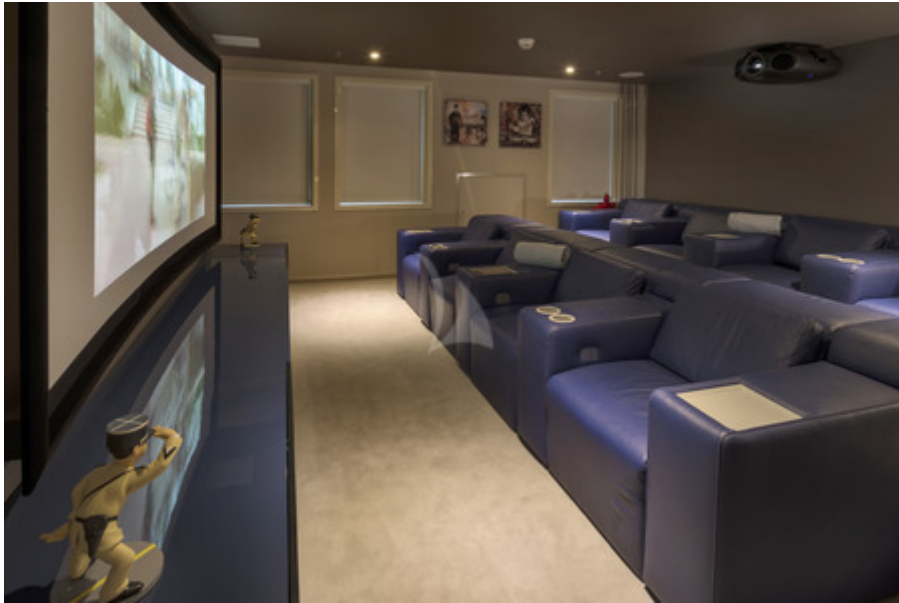
Serenity Cinema Room