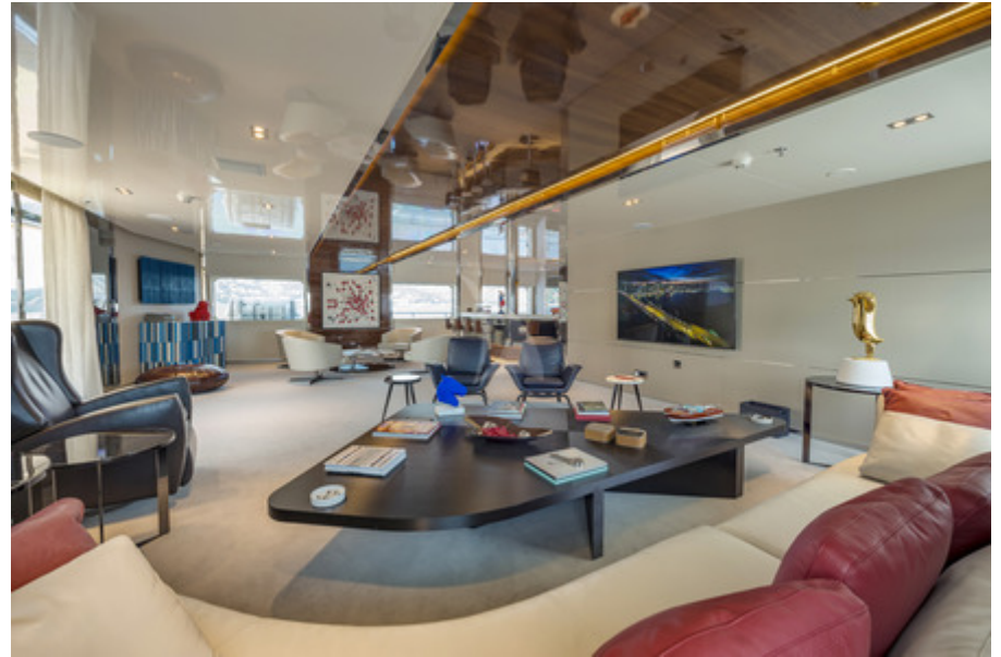
Serenity Owner's Lounge