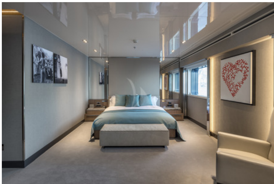
Serenity Executive Suite