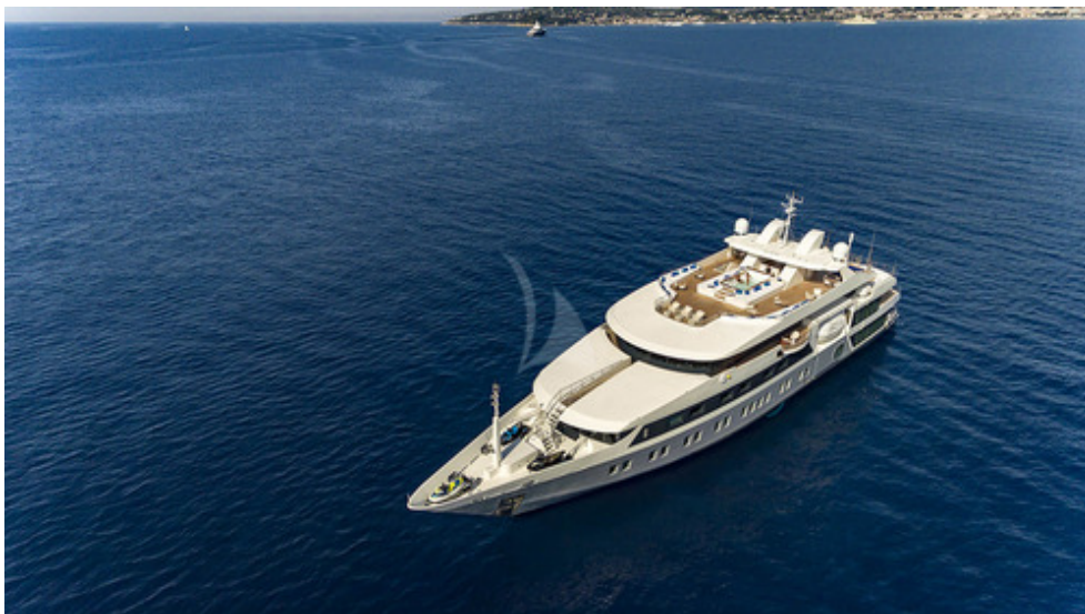
Serenity at Anchor