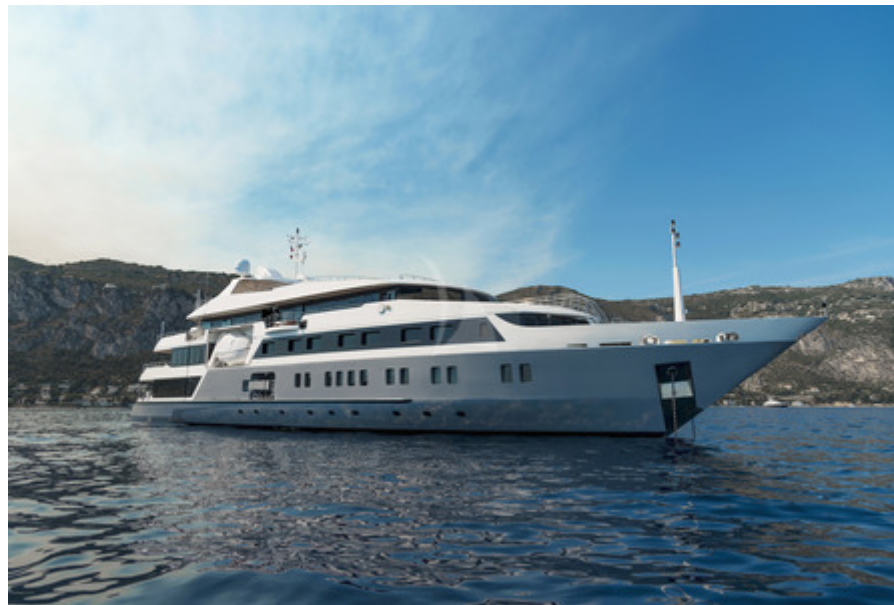
Serenity at Anchor