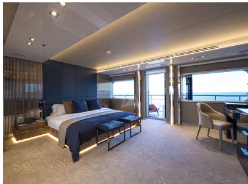
Serenity Owner's Suite