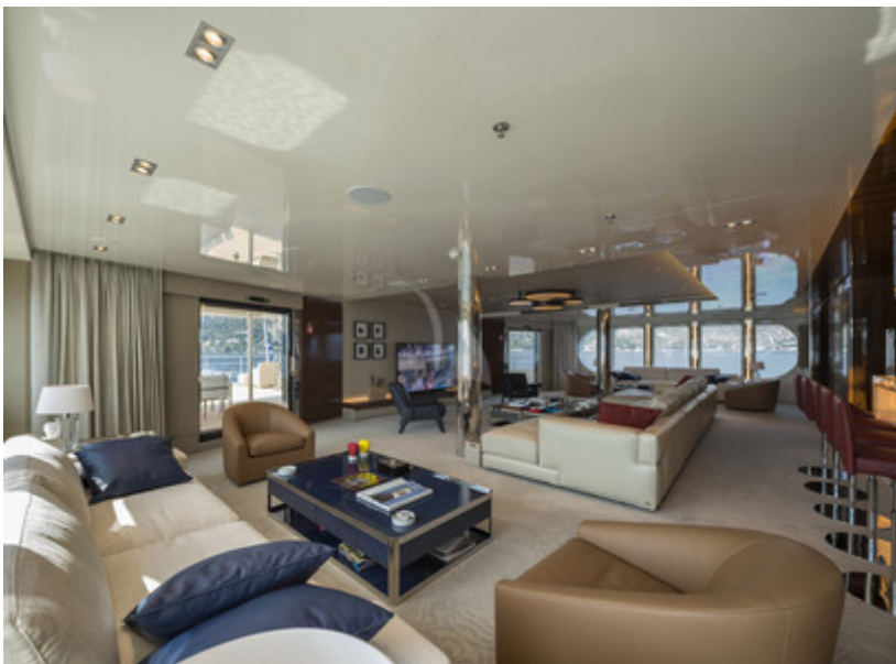
Serenity Main Salon