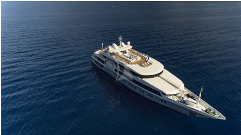
Serenity at Anchor