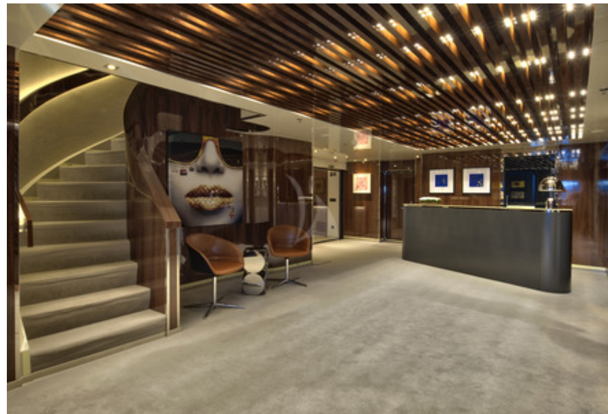
Serenity Main Deck