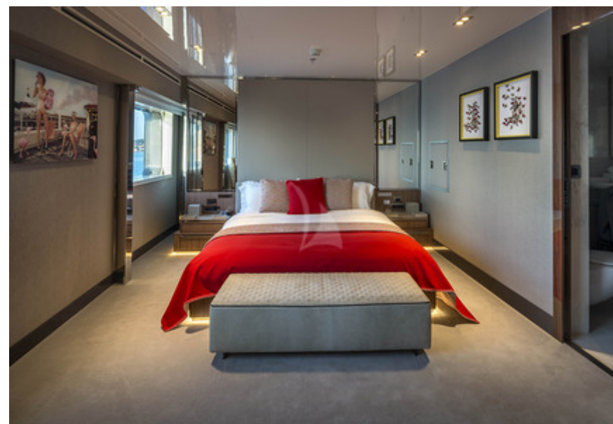
Serenity VIP Cabin