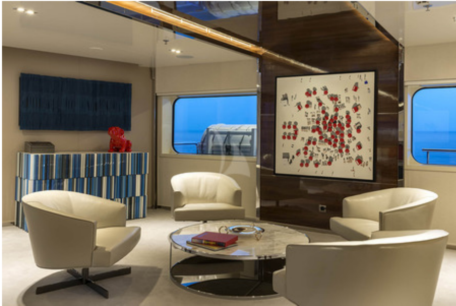
Serenity Owner's Lounge