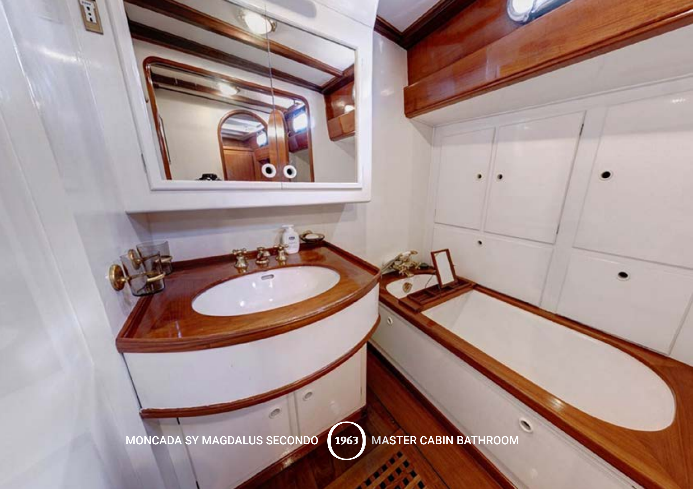
MONCADA SY MAGDALUS SECONDO 1963 MASTER CABIN BATHROOM