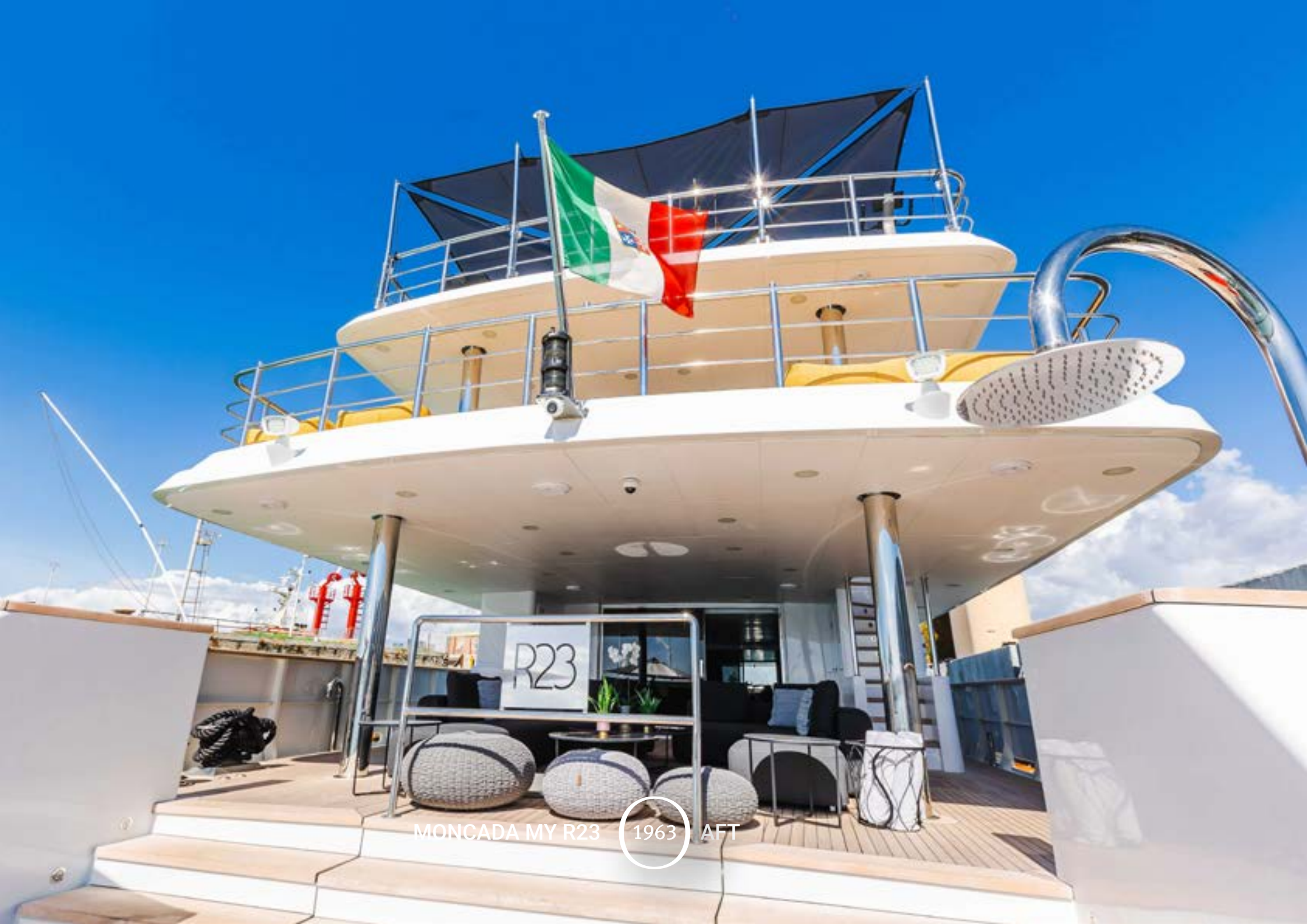
MONCADA MY R23 1963 AFT