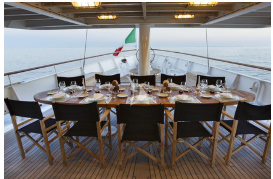
Main aft deck al-fresco dining