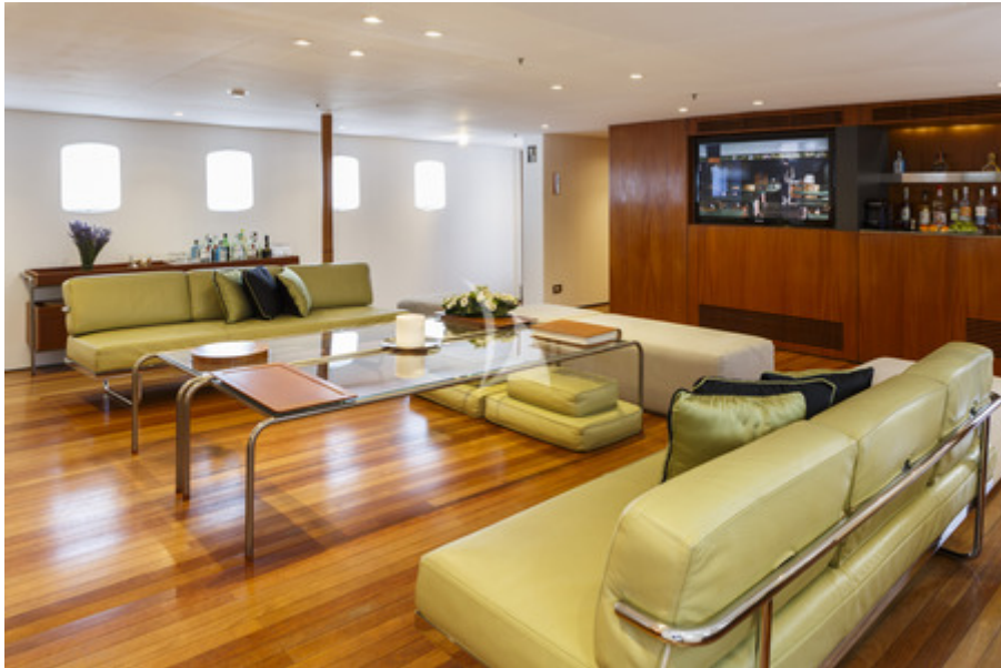
Main salon TV and Bar