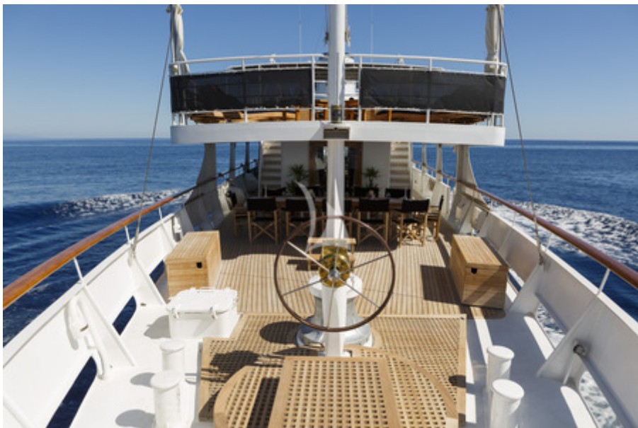
Main aft deck