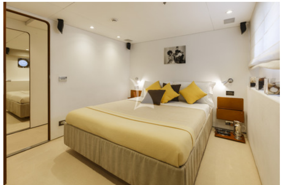
Double guest cabin