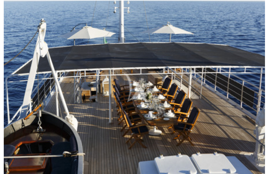
Upper aft deck al-fresco dining