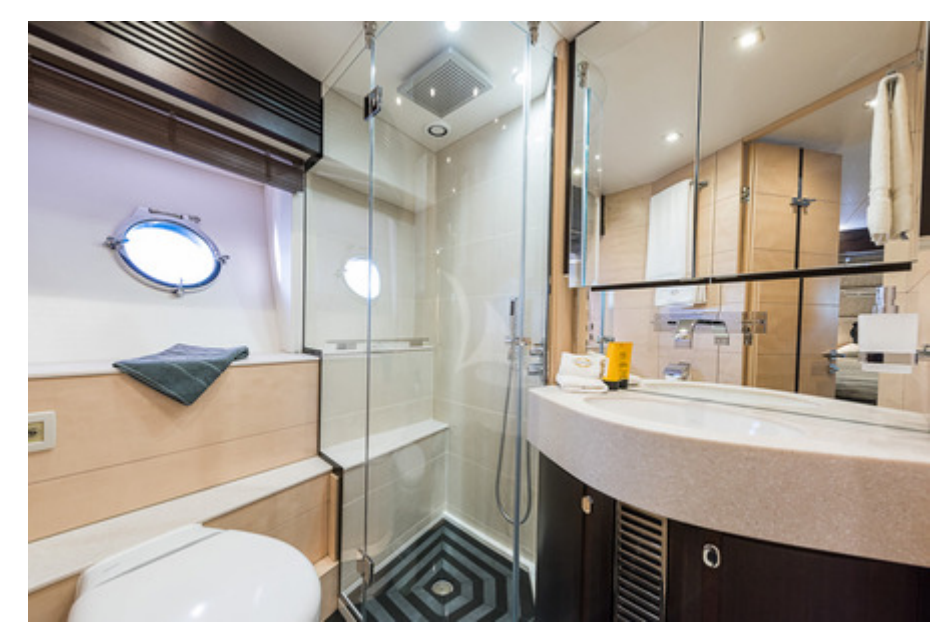
SEA WATER - Master bathroom