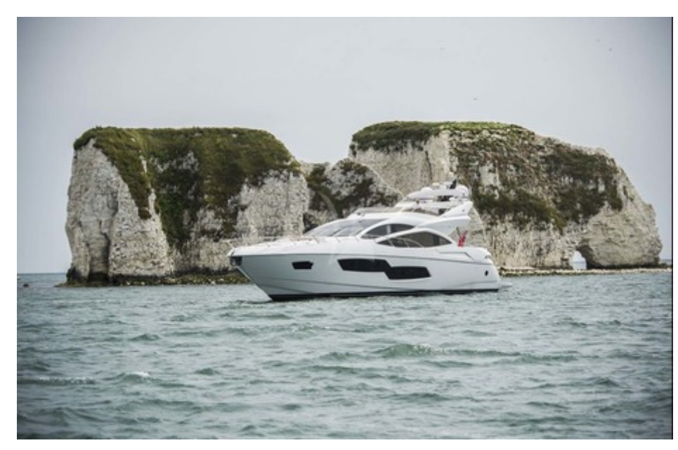
SEA WATER - At anchor