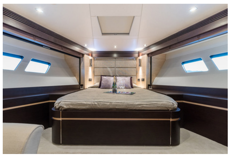
SEA WATER - VIP Cabin