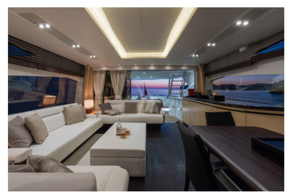
SEA WATER - Saloon