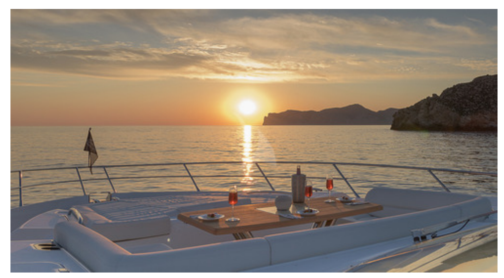
SEA WATER - Foredeck