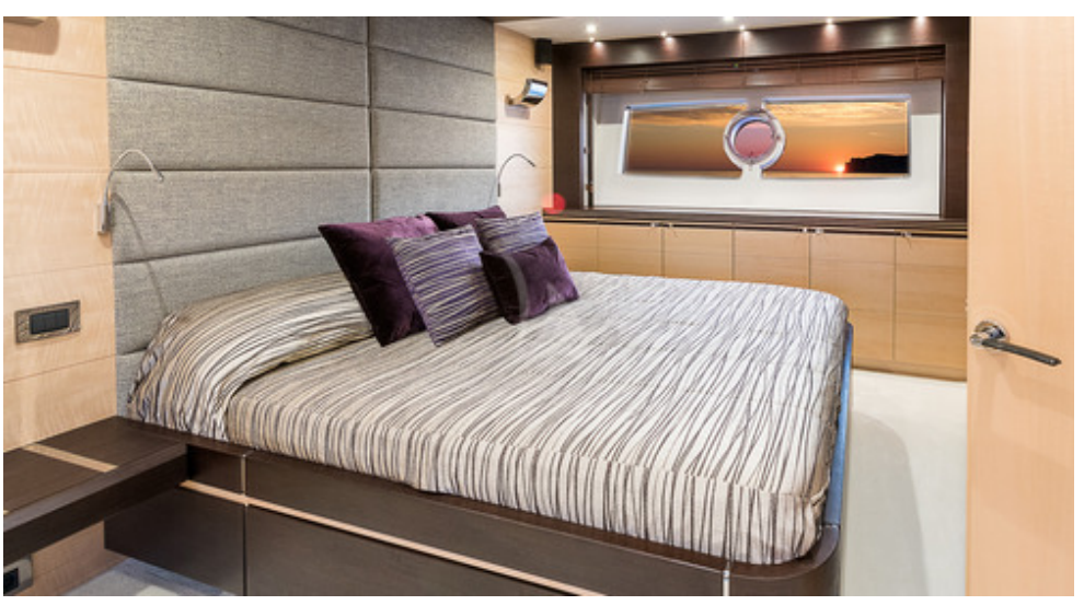
SEA WATER - Master cabin