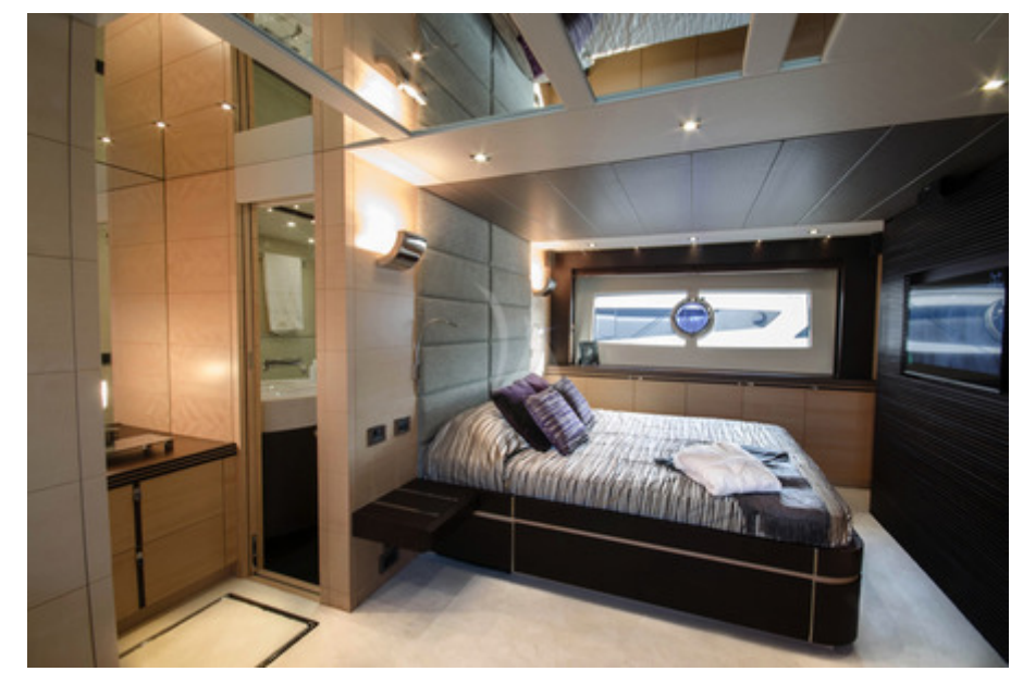
SEA WATER - Master Cabin