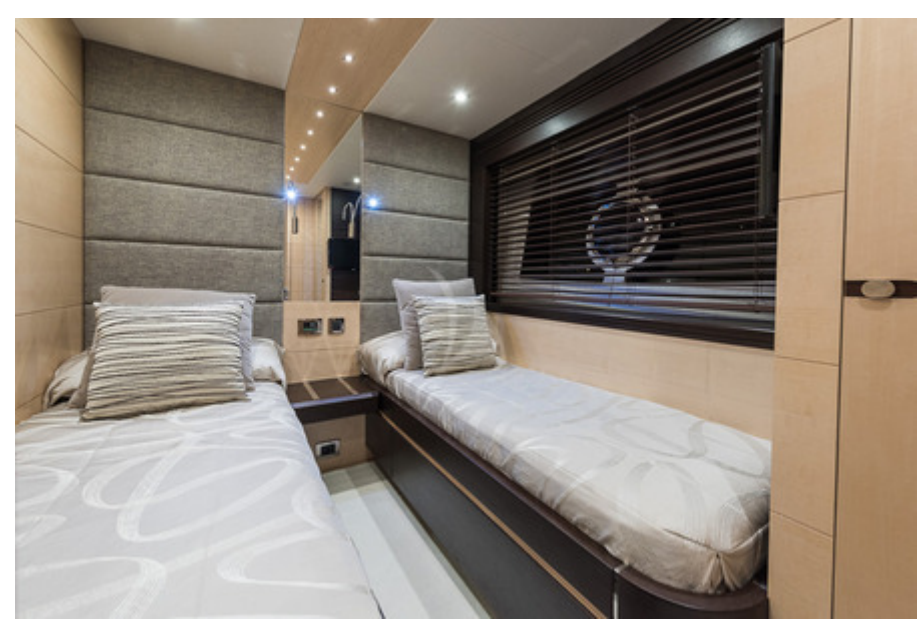
SEA WATER - Twin cabin n°2