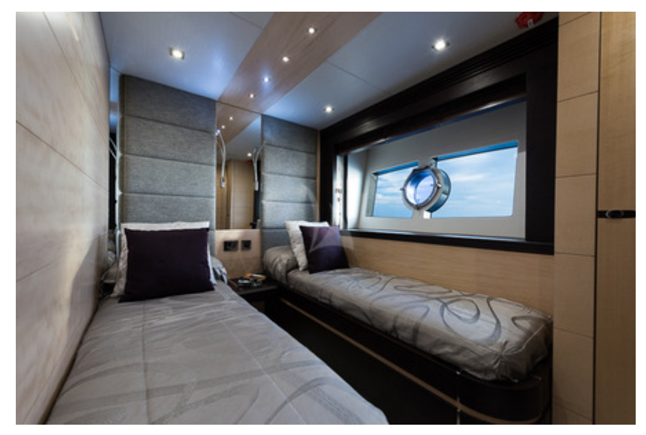
SEA WATER - Twin cabin n°1