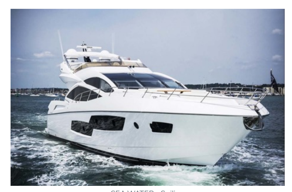
SEA WATER - Sailing