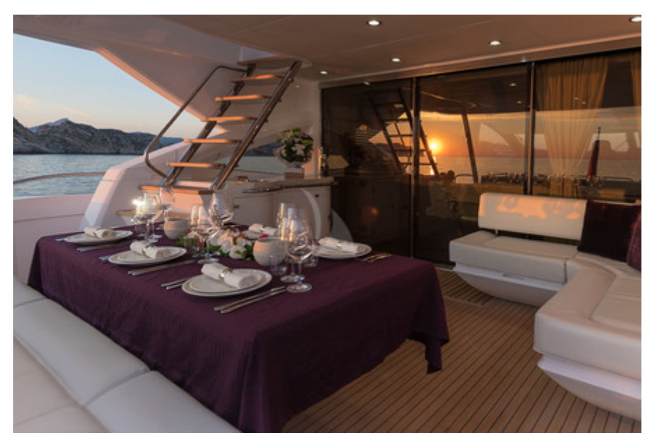
SEA WATER - Aft deck exterior table