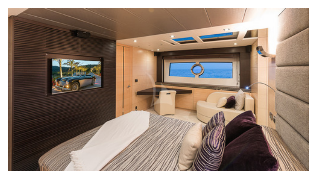
SEA WATER - VIP cabin