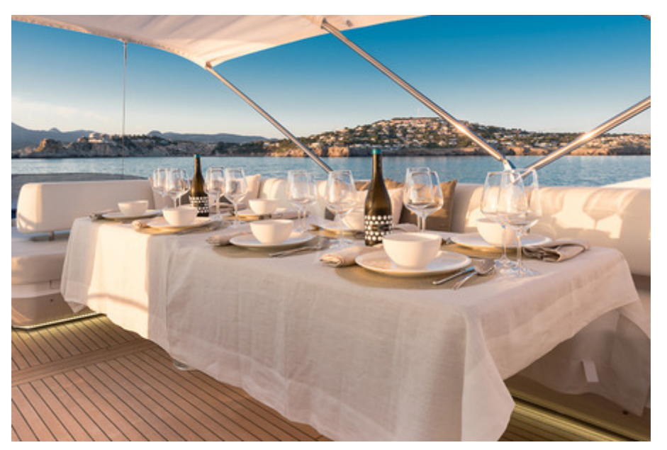
SEA WATER - Flybridge table