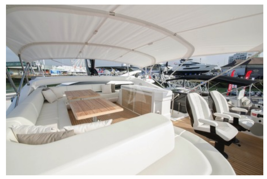
SEA WATER - Flybridge