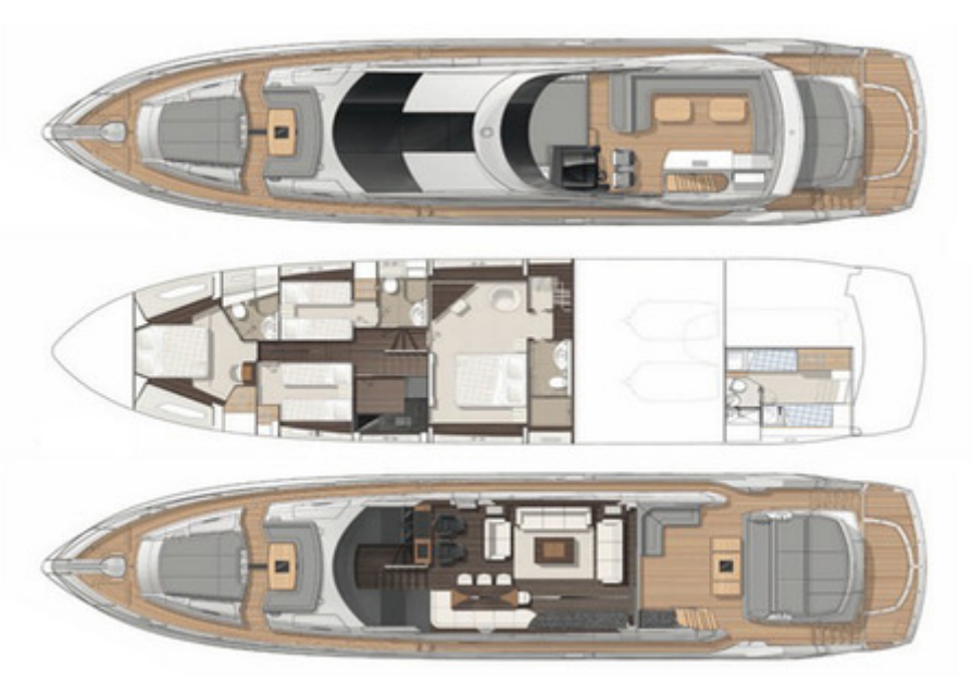
SEA WATER - Layout