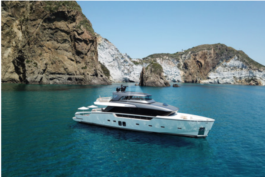
OZONE - Aerial view