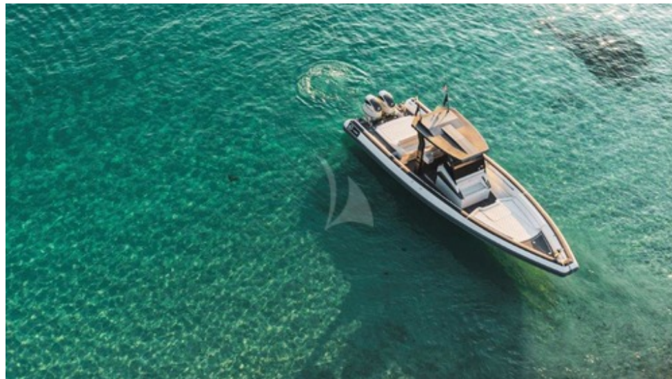
OZONE'S Tender 11 meters brand new 2020