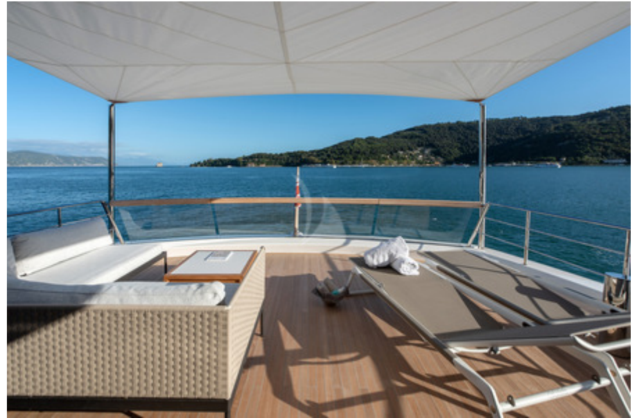
OZONE - Flybridge with bimini