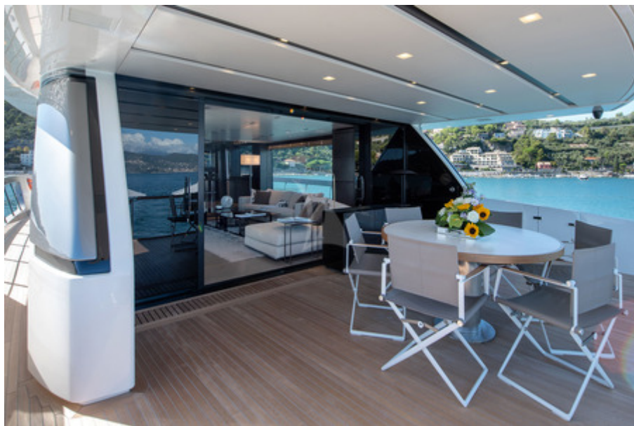
OZONE - Aft deck