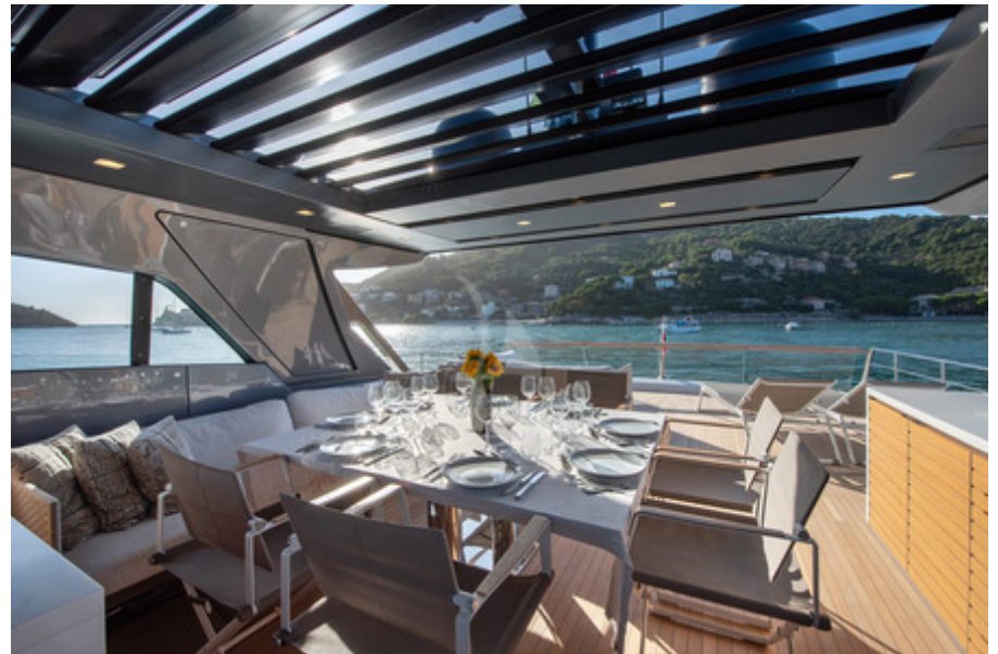
OZONE - Flybridge table