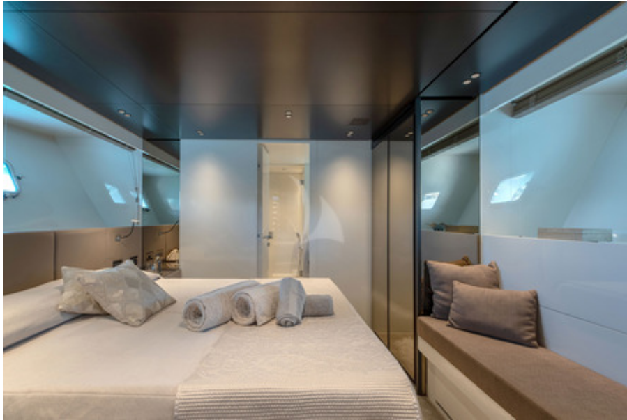
OZONE - VIP cabin