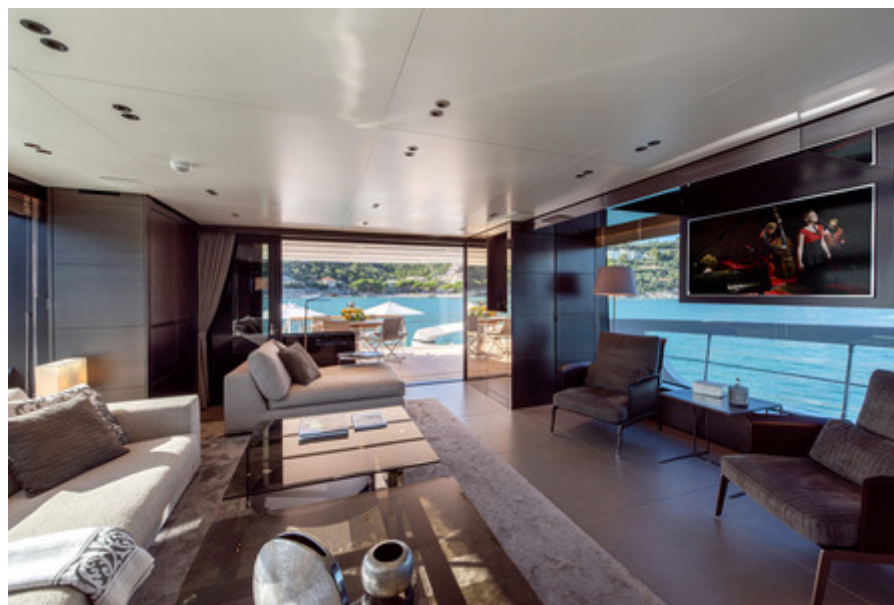
OZONE - Salon with TV