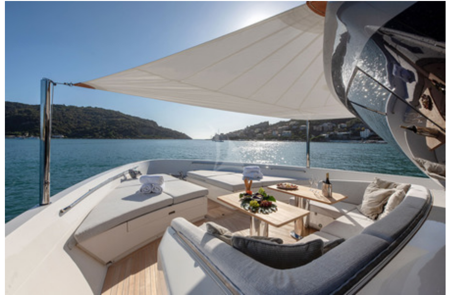
OZONE - Foredeck with bimini