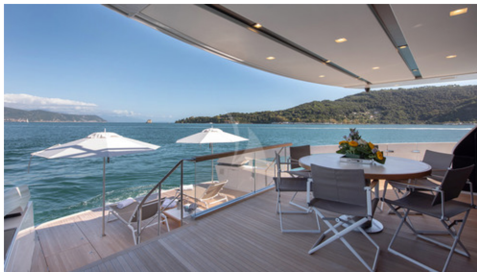
OZONE - Aft deck