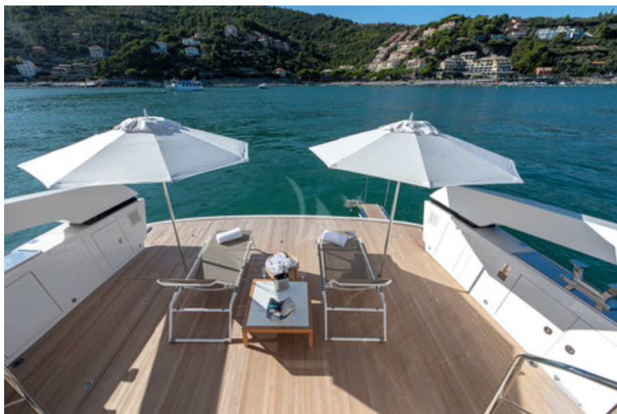
OZONE - Aft deck