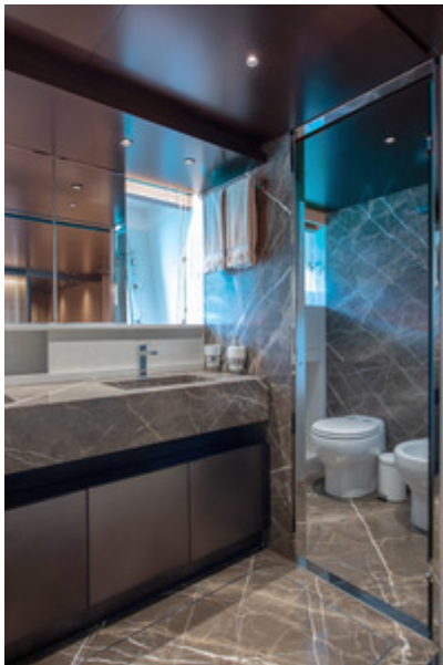
OZONE - Master cabin bathroom