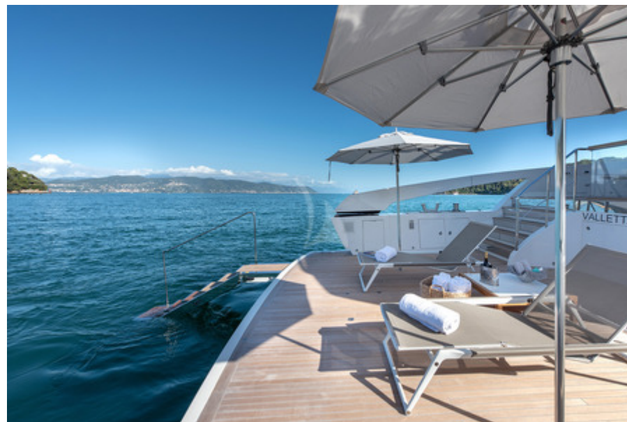
OZONE - Aft deck