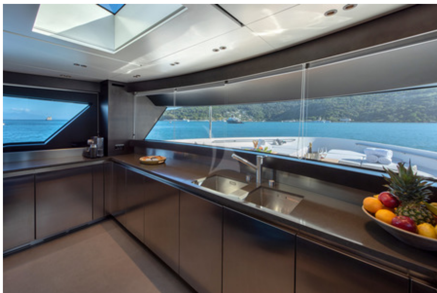
OZONE - Open galley with 360 view