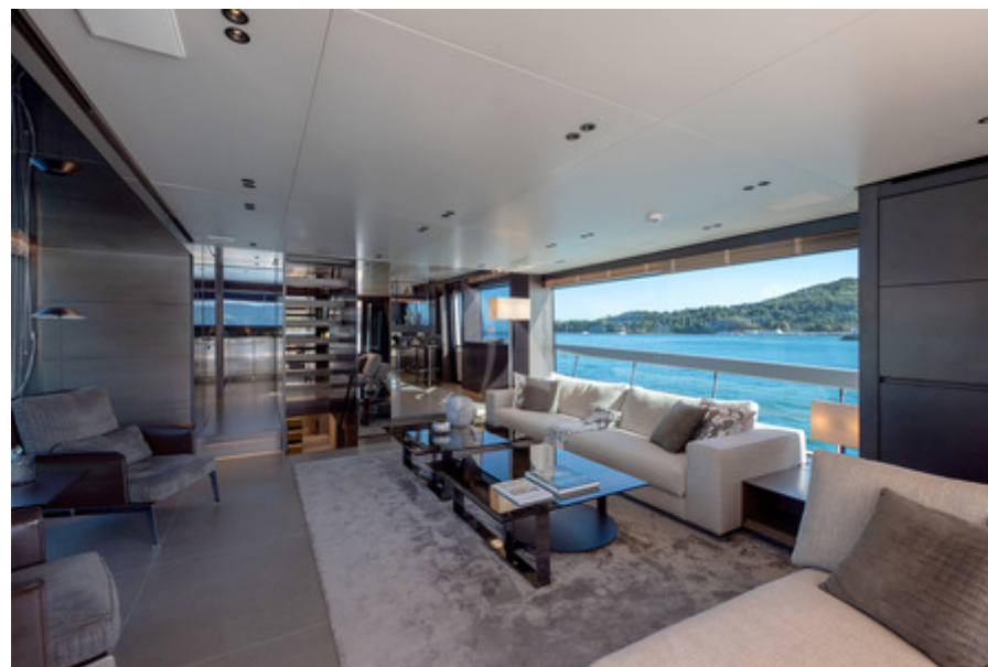
OZONE - Salon