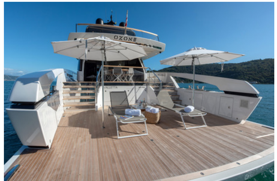
OZONE - Aft deck