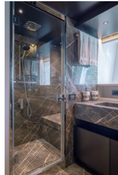
OZONE - Master cabin shower