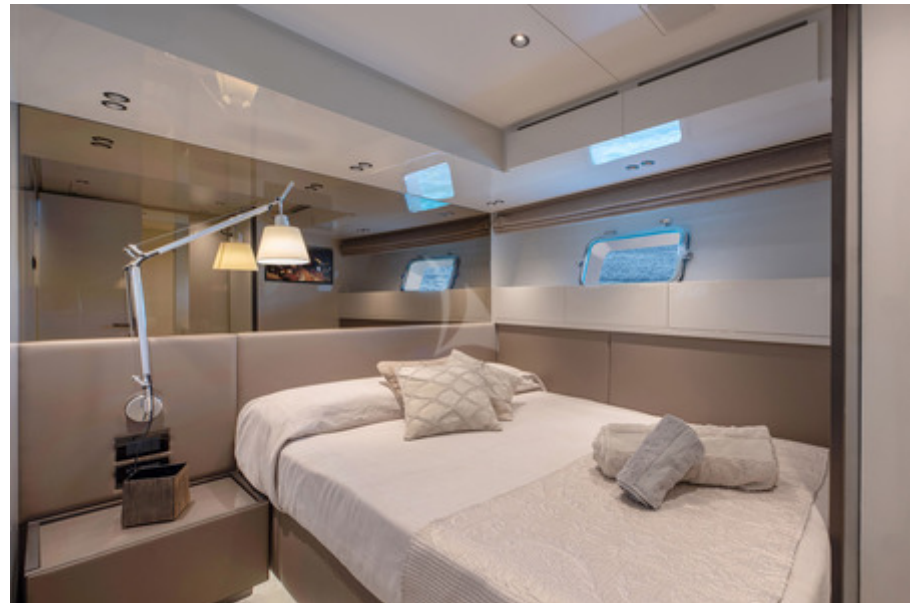
OZONE - Double cabin