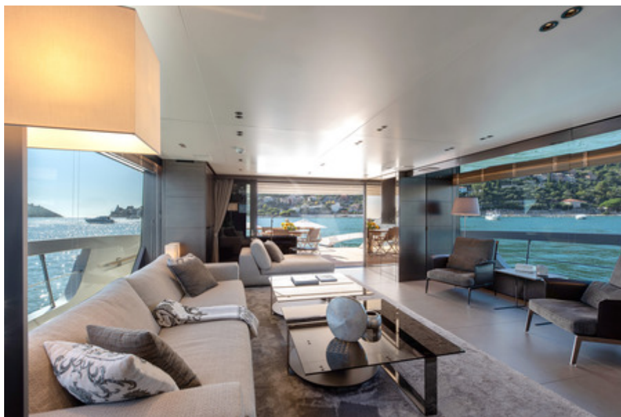
OZONE - Salon