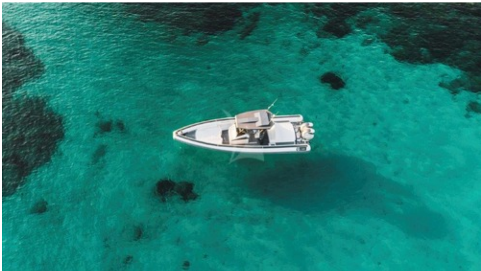
OZONE'S Tender 11 meters brand new 2020