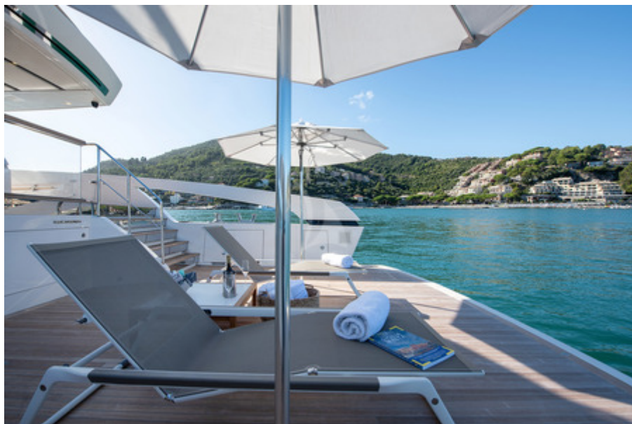
OZONE - Aft deck