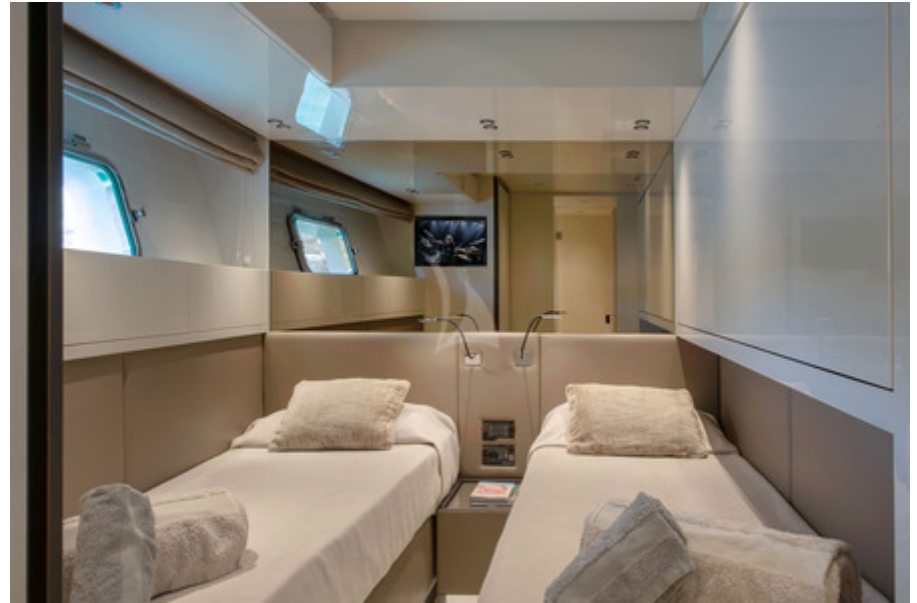
OZONE - Twin cabin