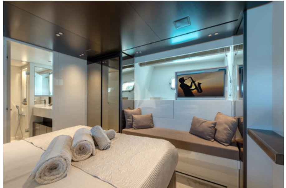
OZONE - VIP cabin