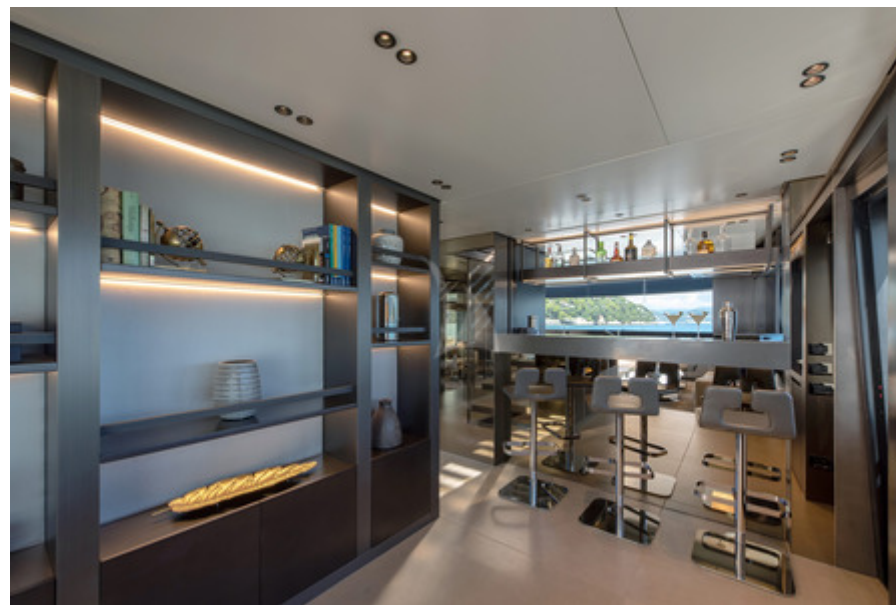
OZONE - Bar