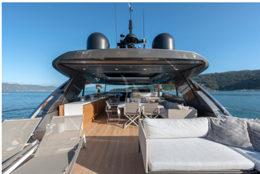
OZONE - Flybridge