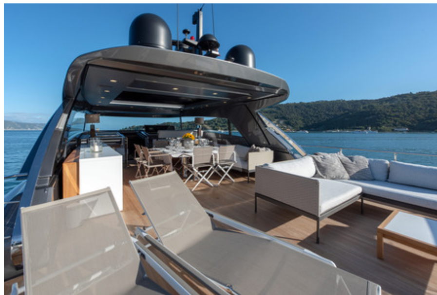
OZONE - Flybridge