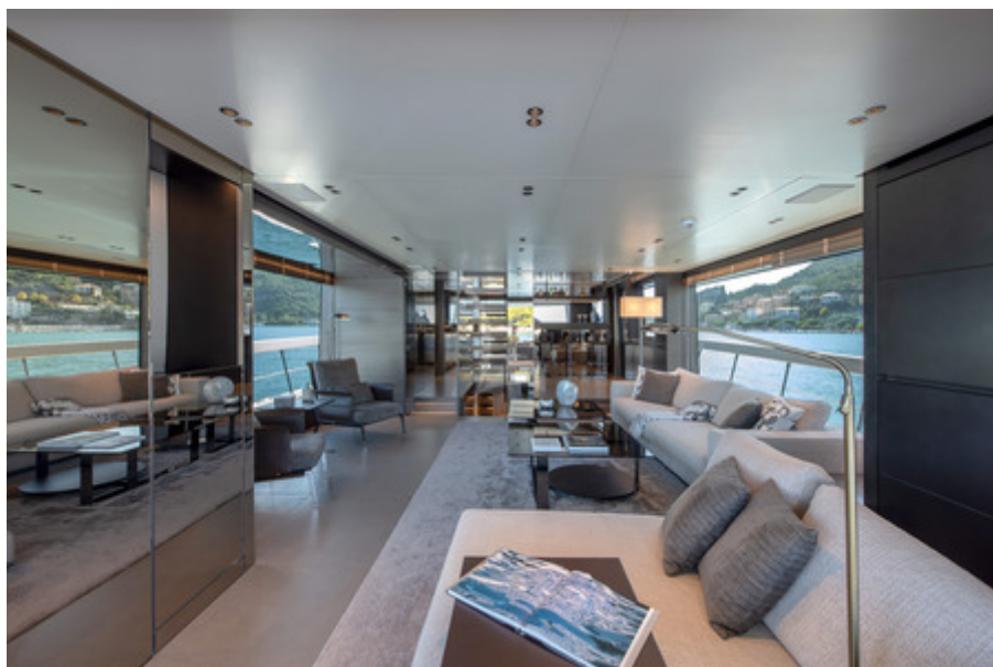
OZONE - Salon with 360 view