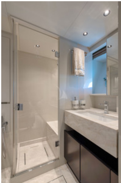
OZONE - Twin cabin bathroom