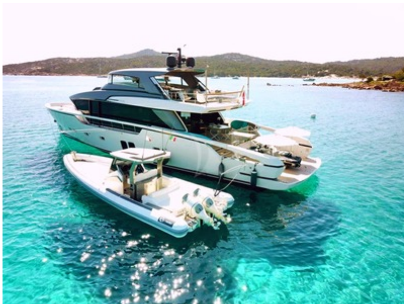
OZONE - Side view with tender