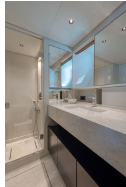
OZONE - VIP cabin bathroom