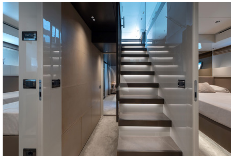
OZONE - Stairs