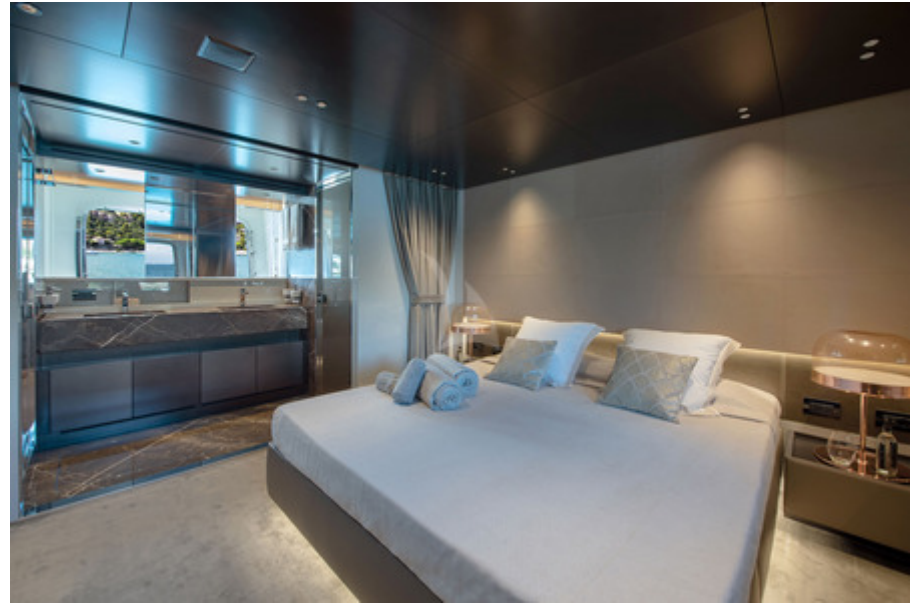
OZONE - Master cabin