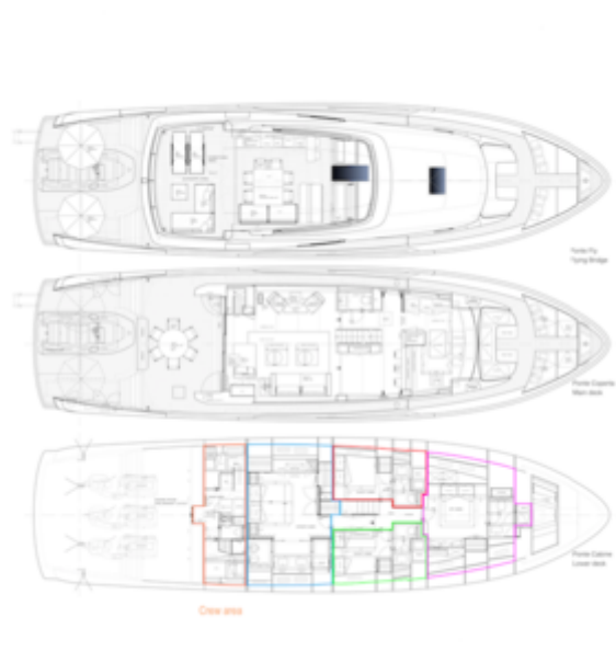
OZONE - Layout