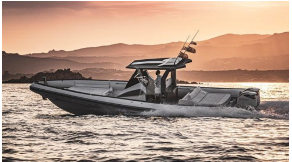
OZONE'S Tender 11 meters brand new 2020