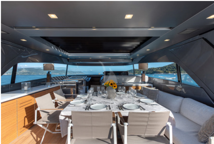
OZONE - Flybridge table