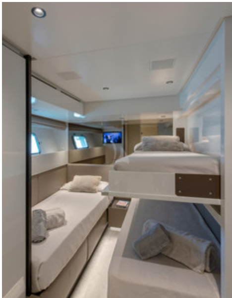
OZONE - Twin cabin with pulman