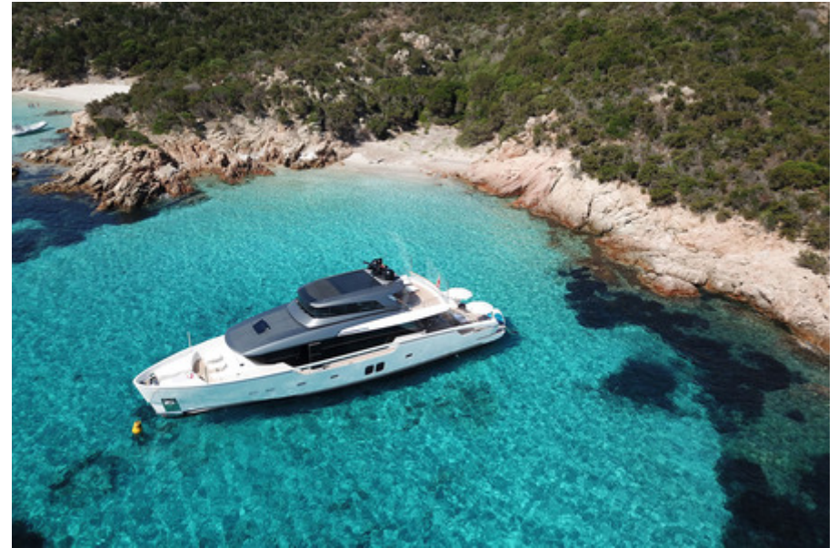
OZONE - Aerial View