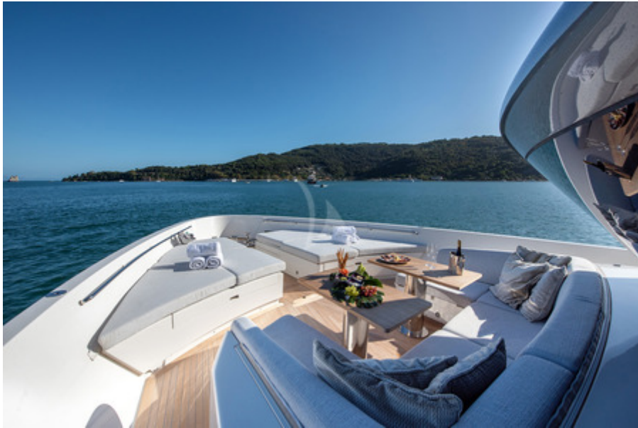
OZONE - Foredeck