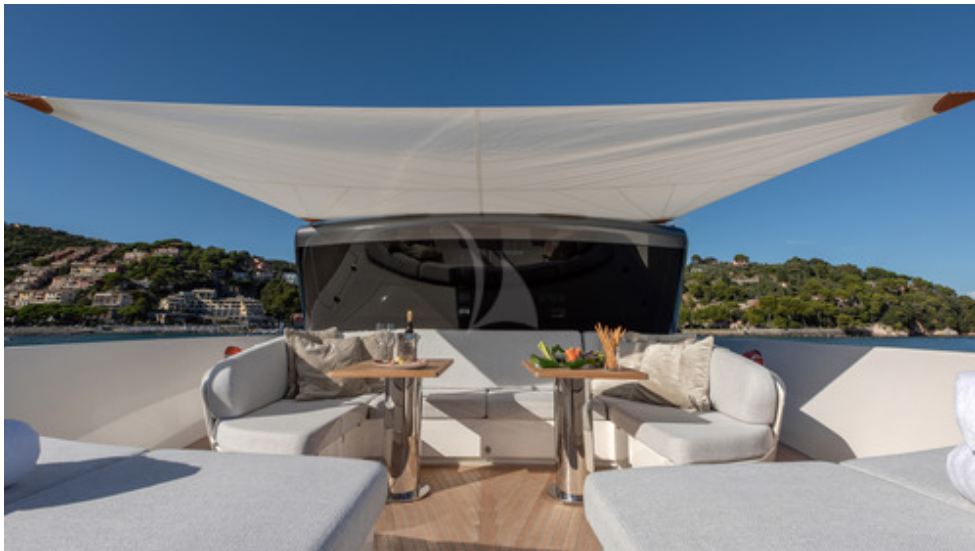
OZONE - Foredeck with bimini