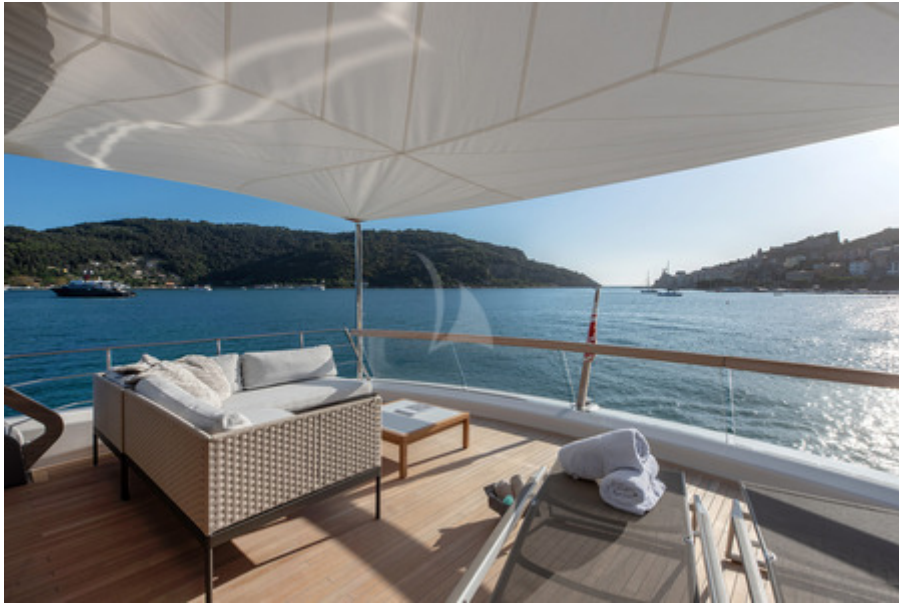
OZONE - Flybridge with bimini