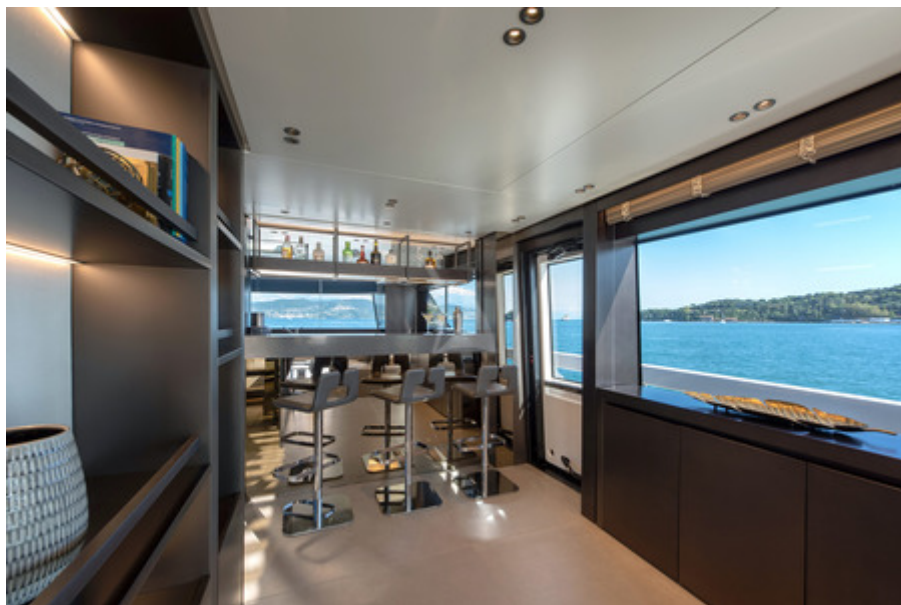
OZONE - Bar