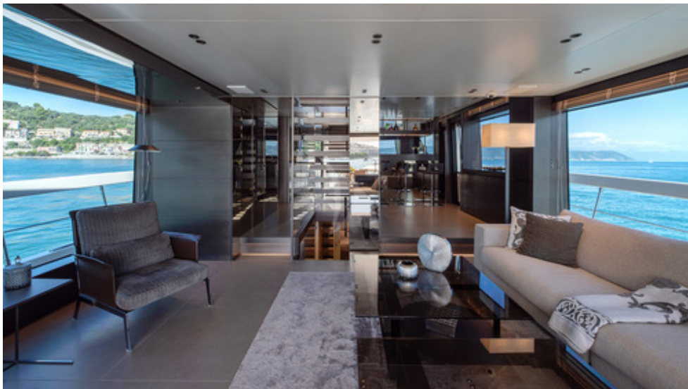
OZONE - Salon with 360 view