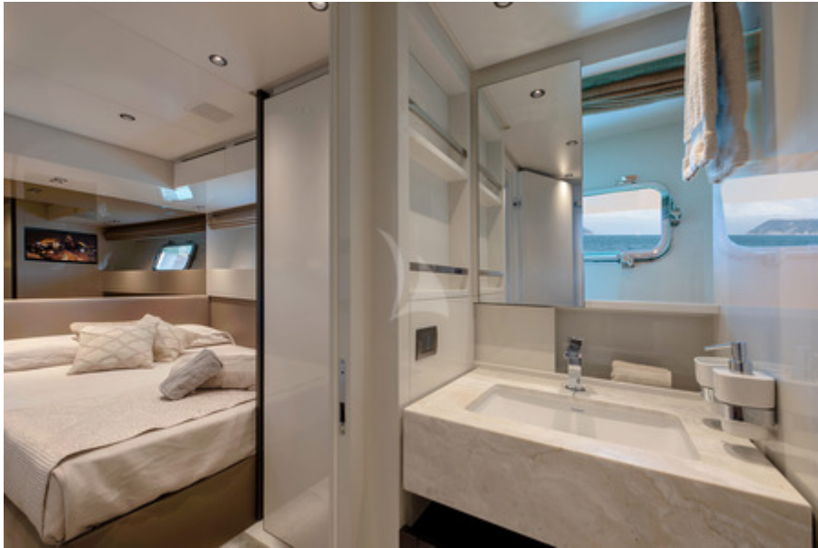
OZONE - Double cabin bathroom