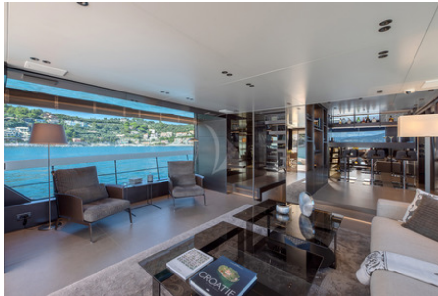
OZONE - Salon