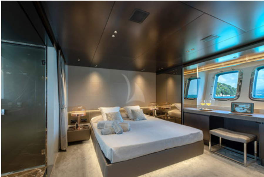
OZONE - Master cabin