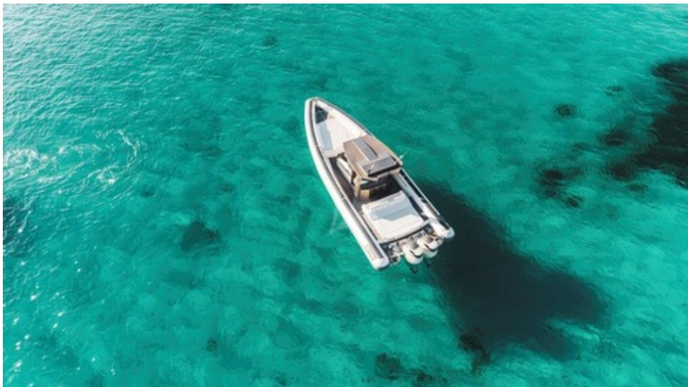
OZONE'S Tender 11 meters brand new 2020