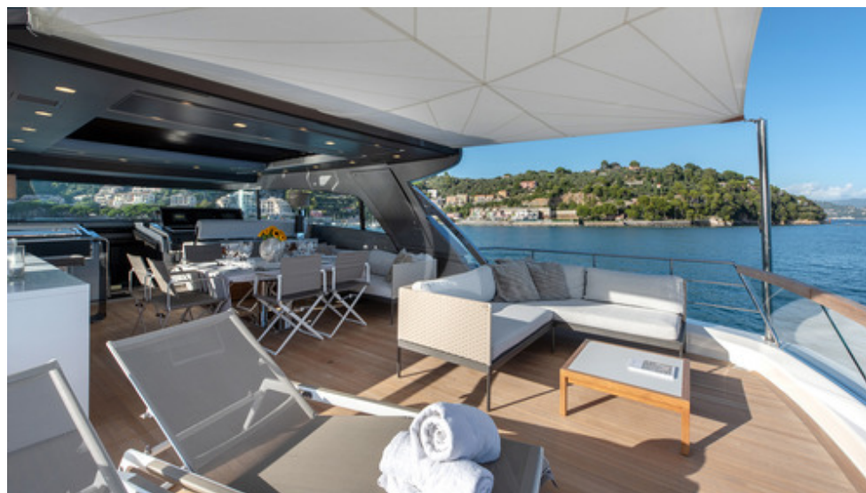
OZONE - Flybridge