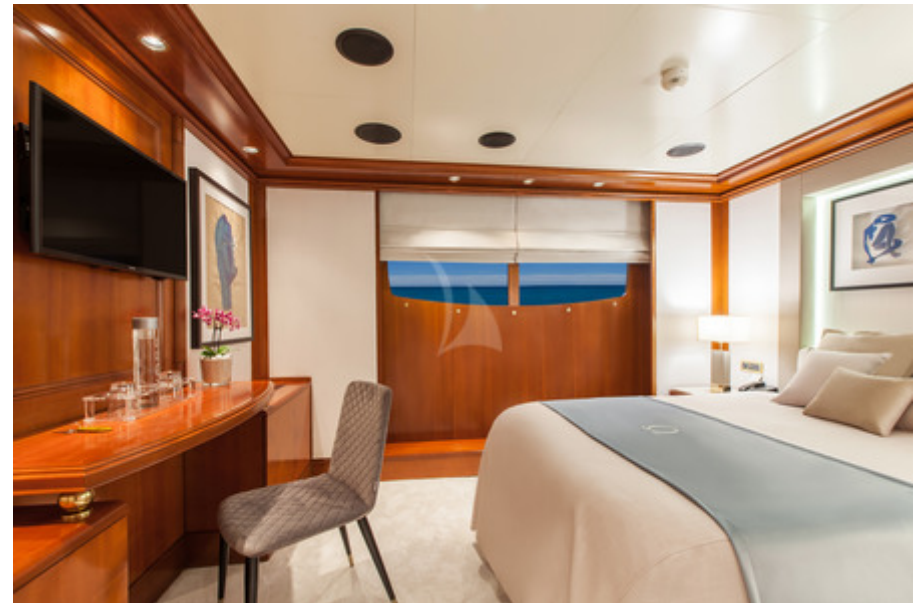
OMEGA MAIN DECK GUEST DOUBLE CABIN