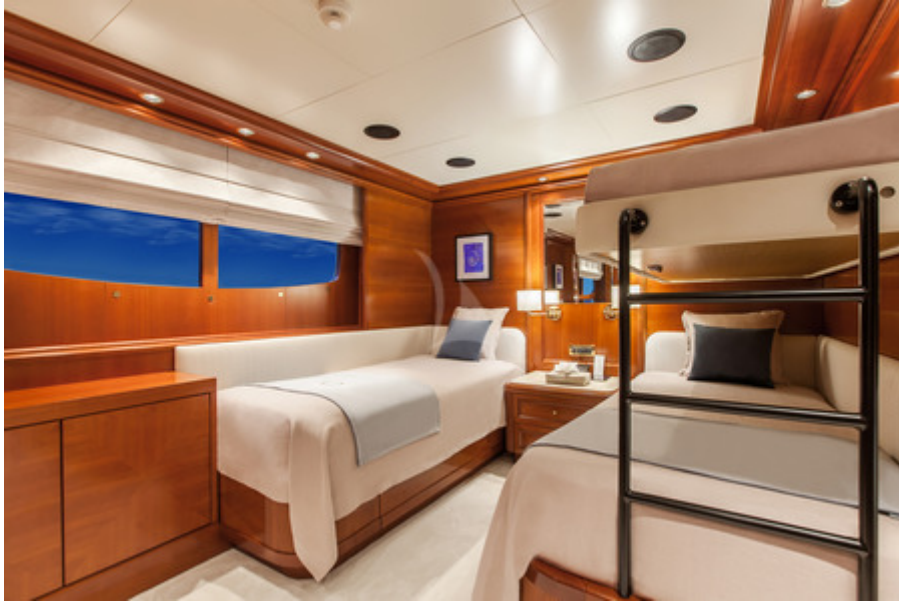
OMEGA MAIN DECK GUEST CABIN TWIN