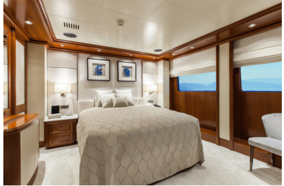
OMEGA UPPER DECK VIP DOUBLE CABIN4