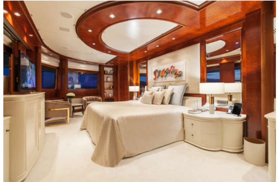
OMEGA UPPER DECK MASTER SUITE