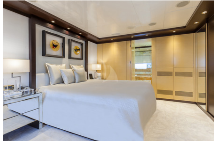
OMEGA BRIDGE DECK EXECUTIVE SUITE