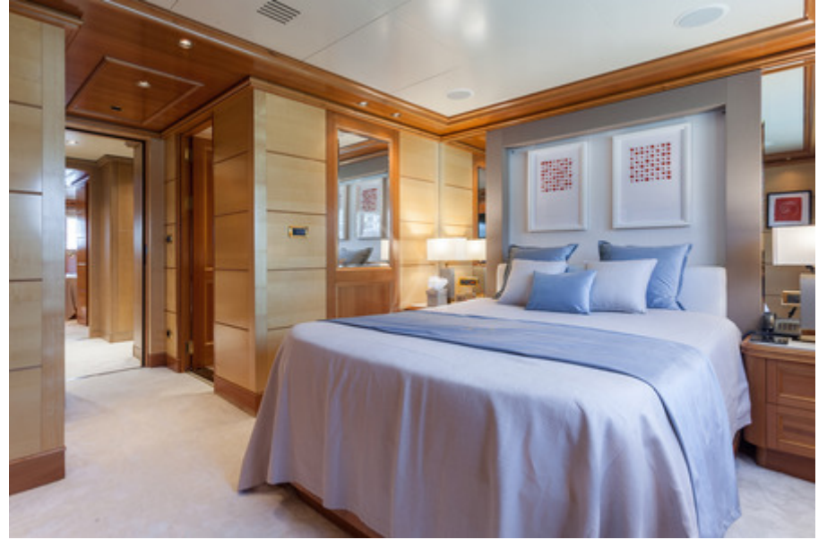
OMEGA MAIN DECK GUEST CABIN DOUBLE1