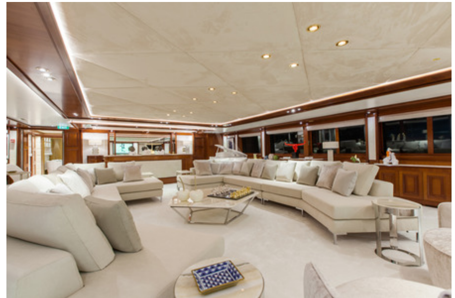
OMEGA UPPER DECK VIP LOUNGE1