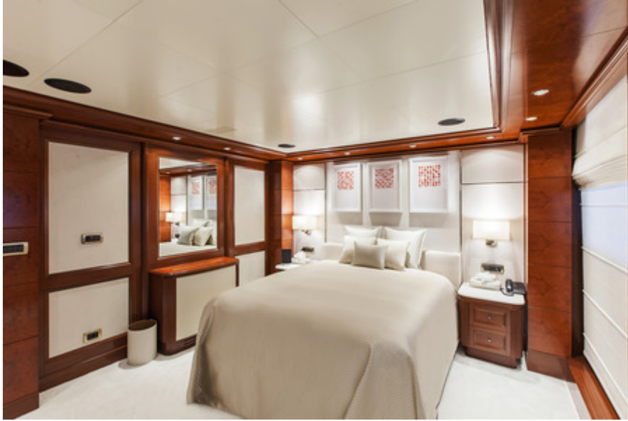
OMEGA UPPER DECK VIP DOUBLE CABIN2