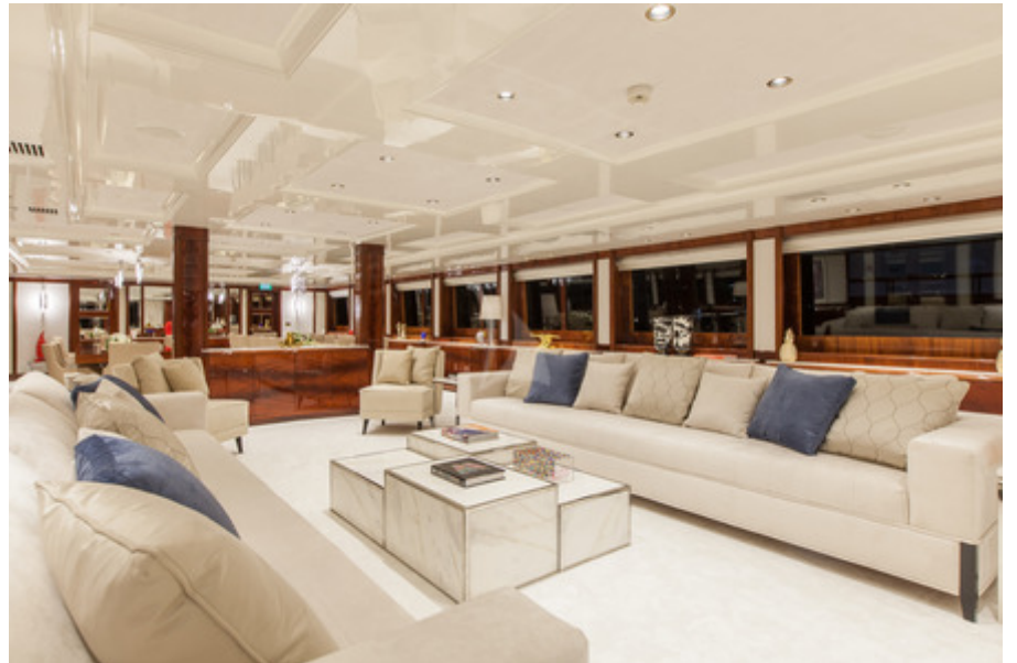
OMEGA SALON AREA MAIN DECK