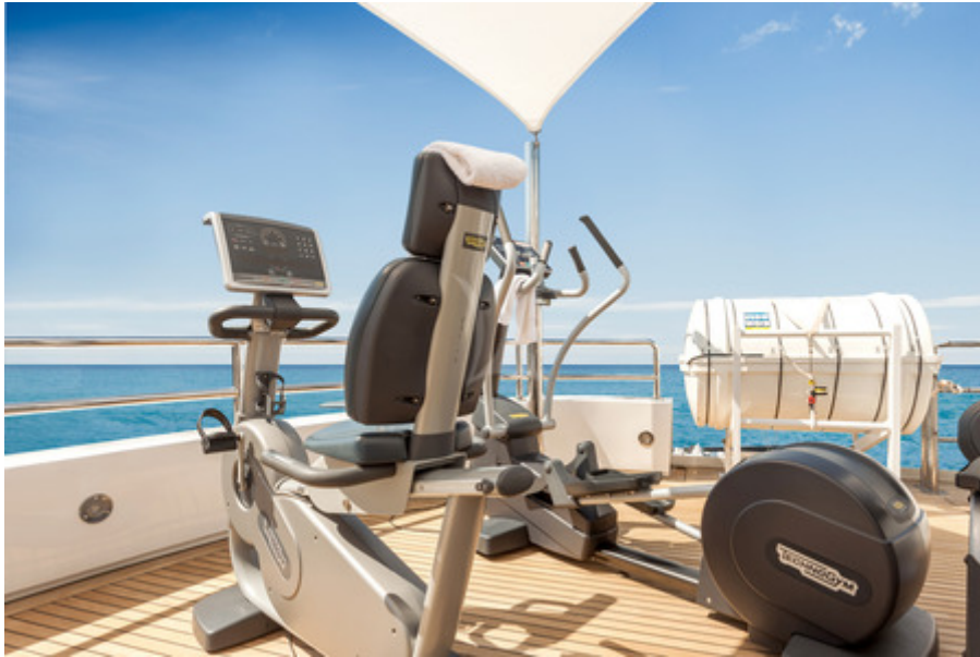
OMEGA BRIDGE DECK GYM1