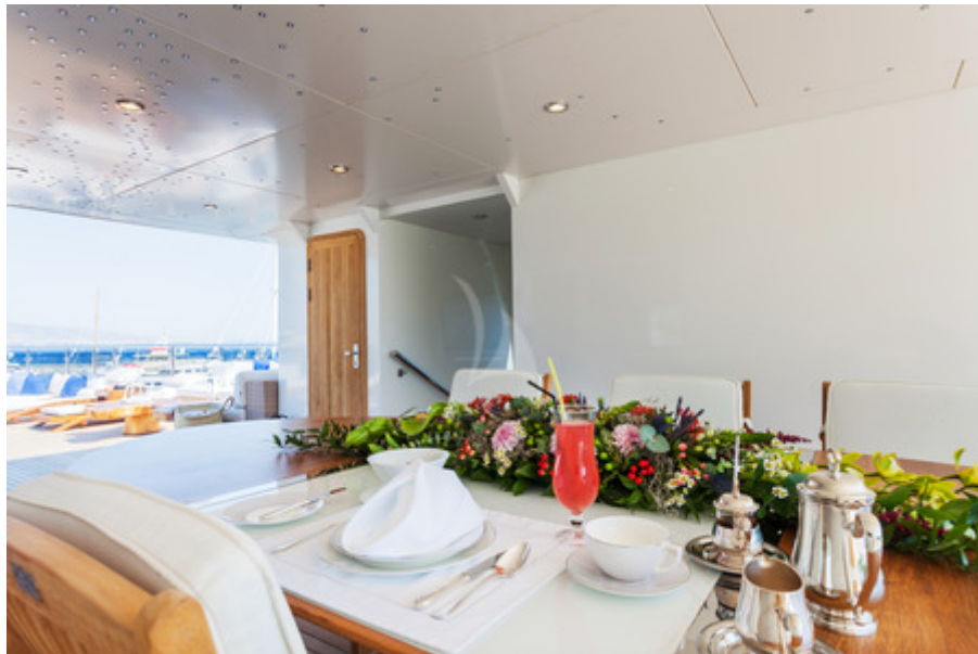
OMEGA SUN DECK DINNING AREA