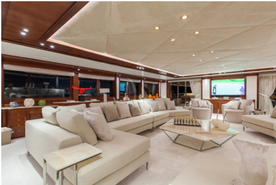
OMEGA UPPER DECK VIP LOUNGE