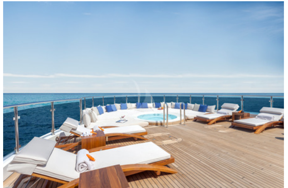
OMEGA SUN DECK