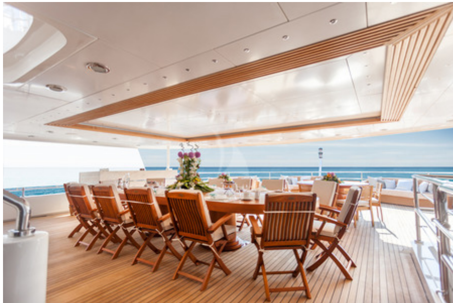
OMEGA UPPER DECK DINNING AREA