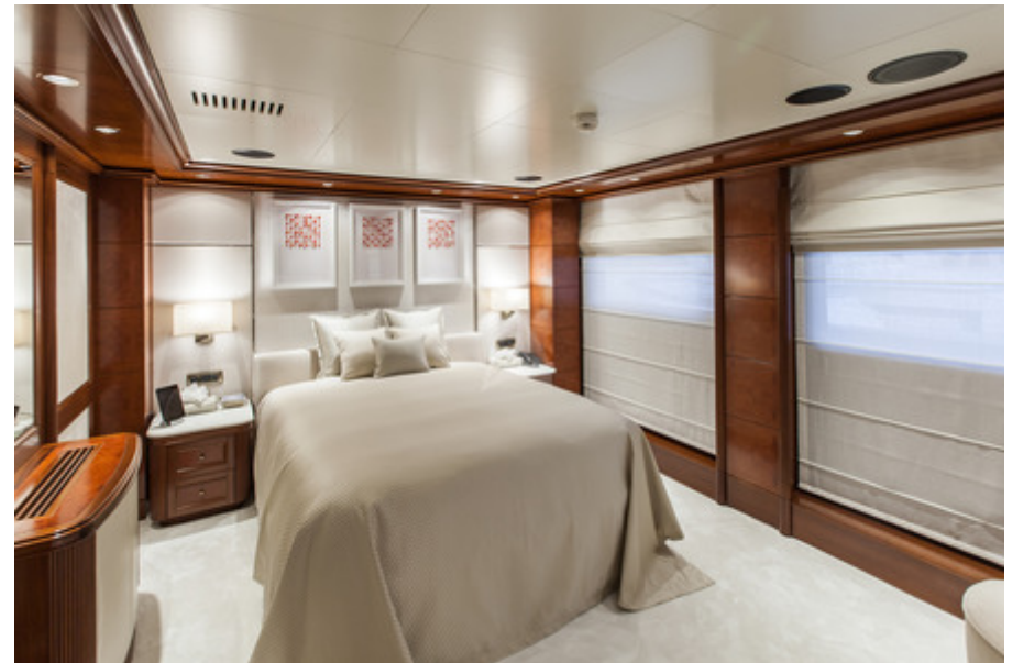
OMEGA UPPER DECK VIP DOUBLE CABIN