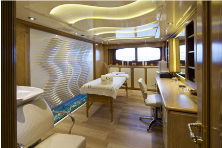
OMEGA SPA AND BEAUTY SALON