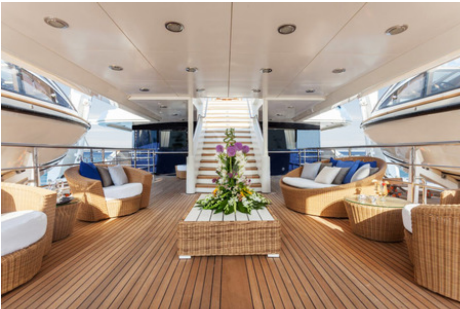
OMEGA BRIDGE DECK RELAXATION