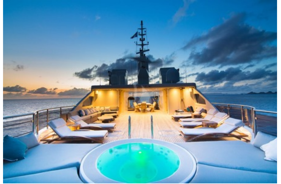
OMEGA SUN DECK JACUZZI