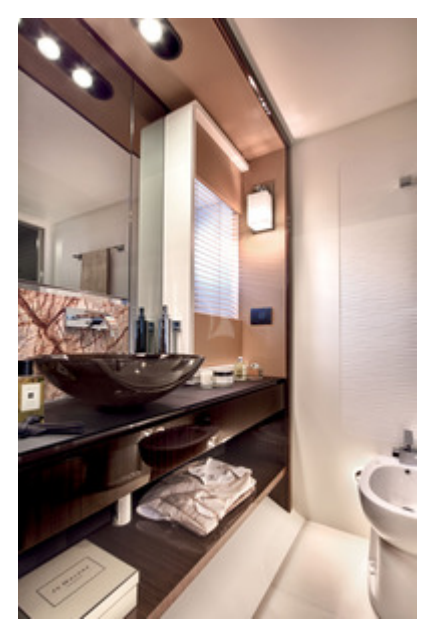
Makani Master Cabin Bathroom