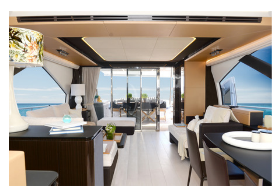
Makani Main Salon