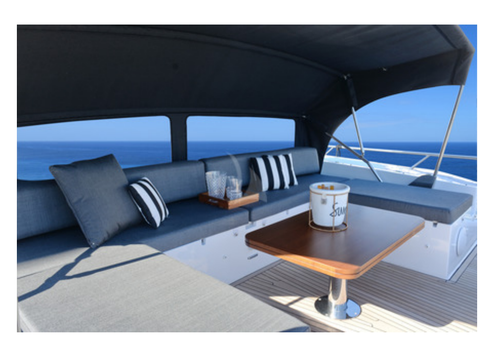
Makani External Sitting Area