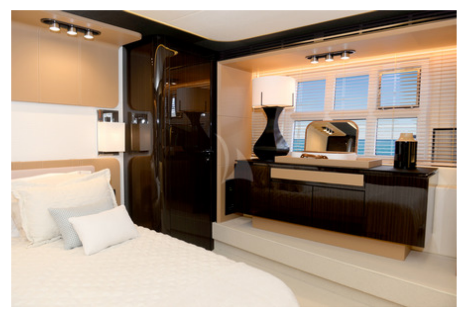
Makani Master Cabin