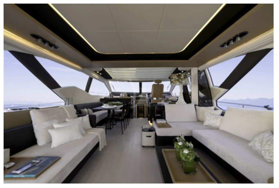
Makani Main Salon