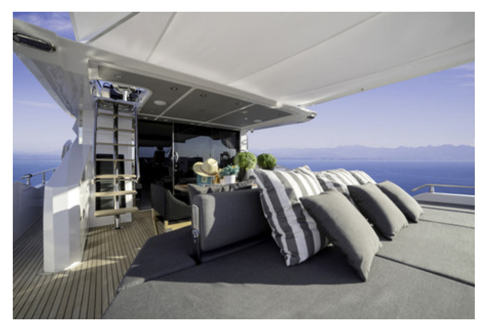
Makani External Sitting Area