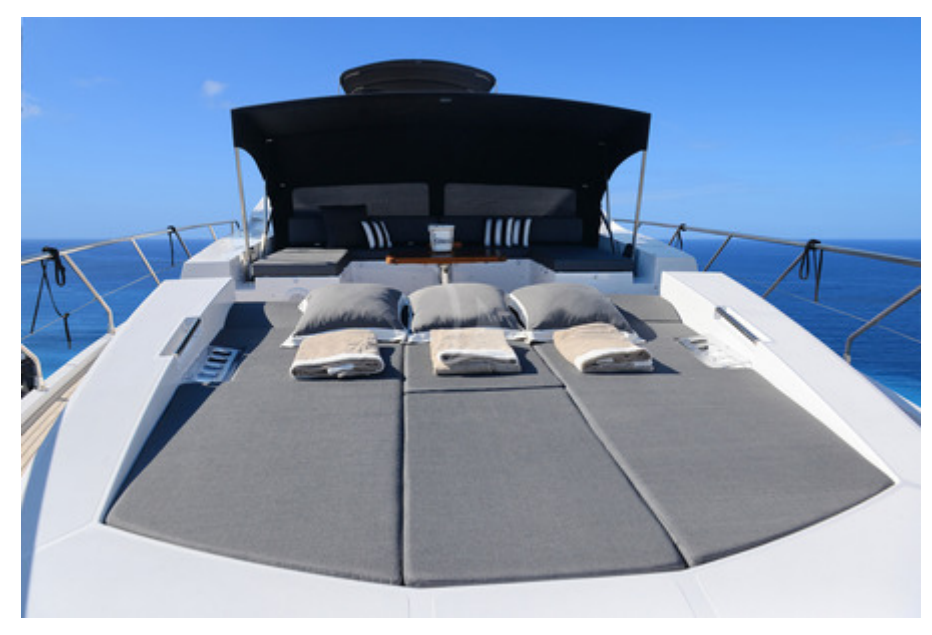
Makani External Sitting Area