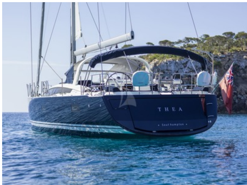
THEA - Aft view