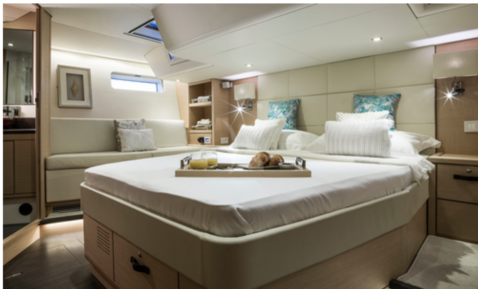
THEA - Master Cabin