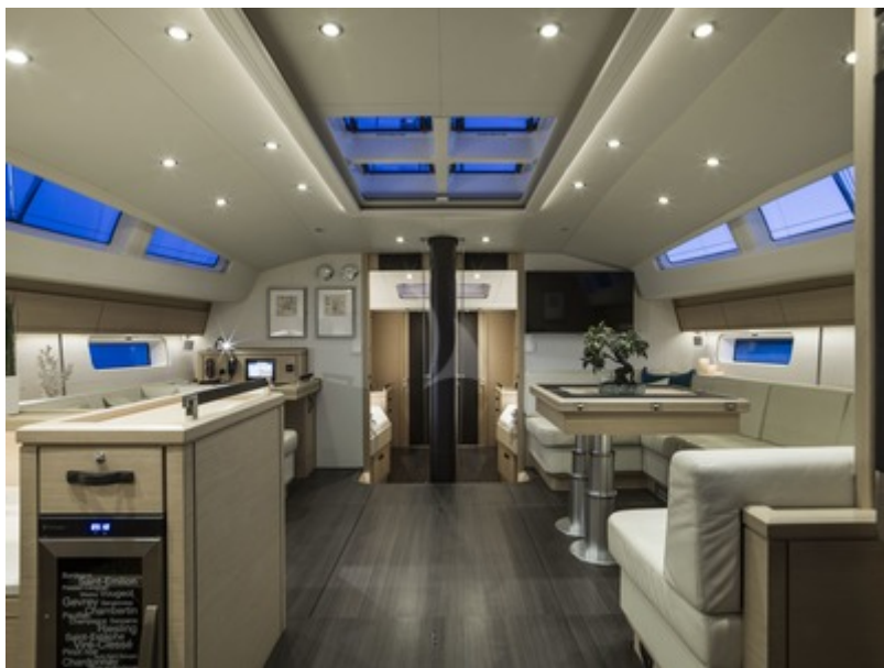
THEA - Salon