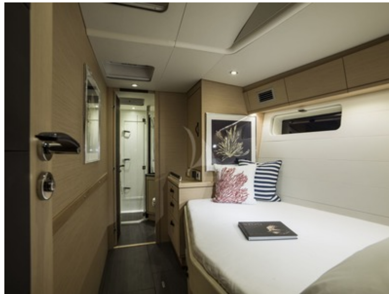
THEA - Guest Cabin