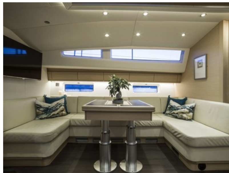
THEA - Salon