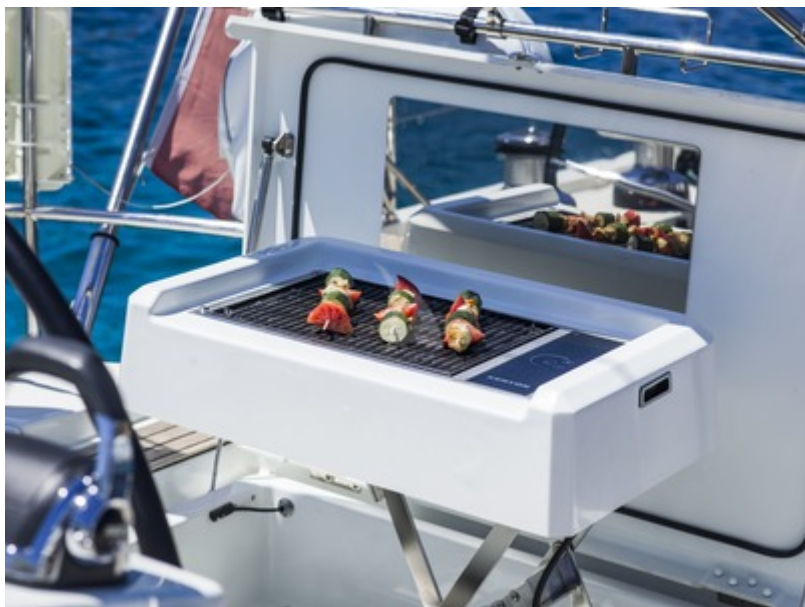
THEA - BBQ