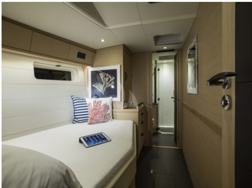
THEA - Guest Cabin