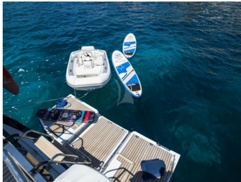
THEA - Water Toys