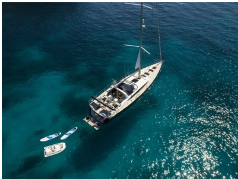
THEA - Aerial view