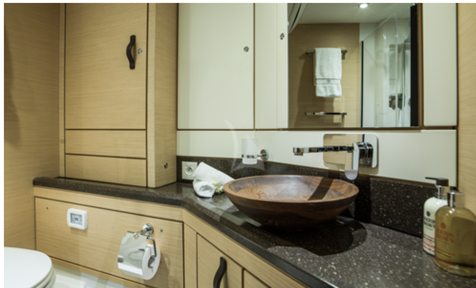
THEA - Master Bathroom