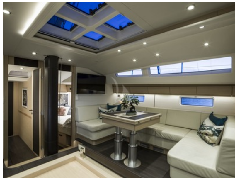
THEA - Salon