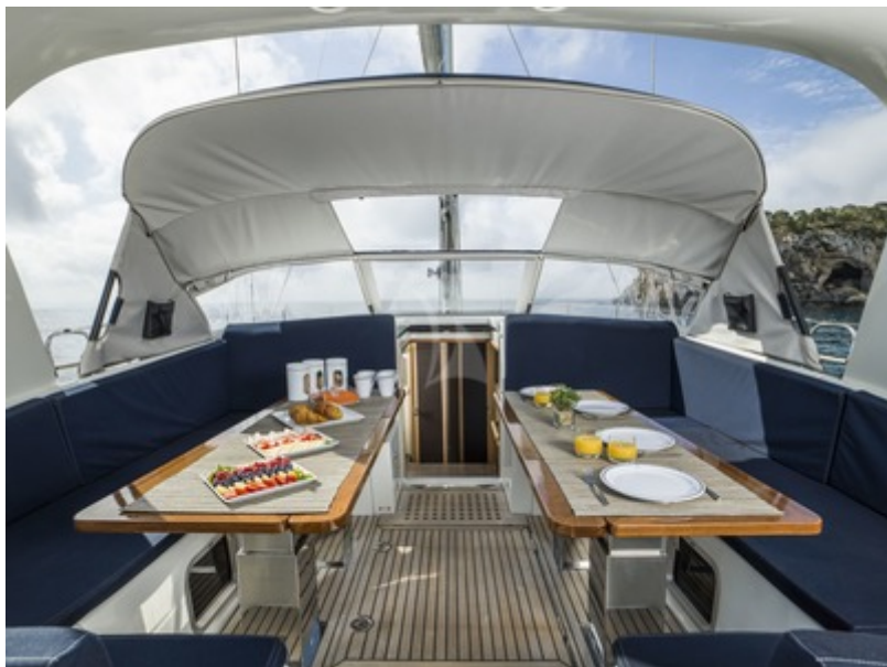
THEA - Cockpit