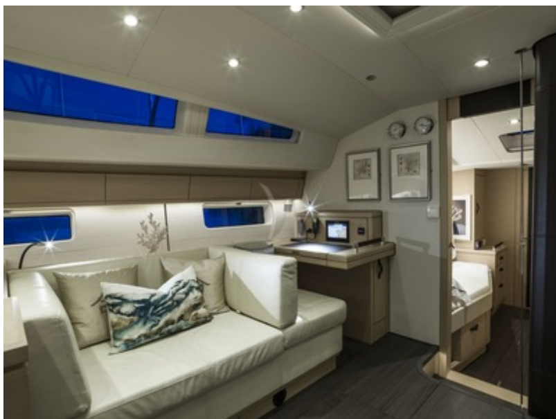
THEA - Salon