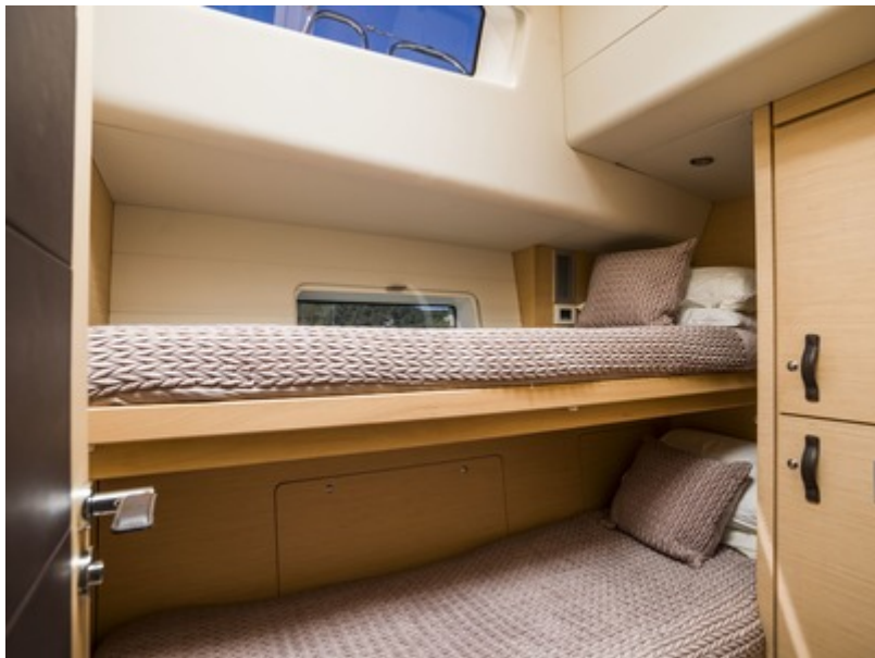
THEA - Bunk Cabin