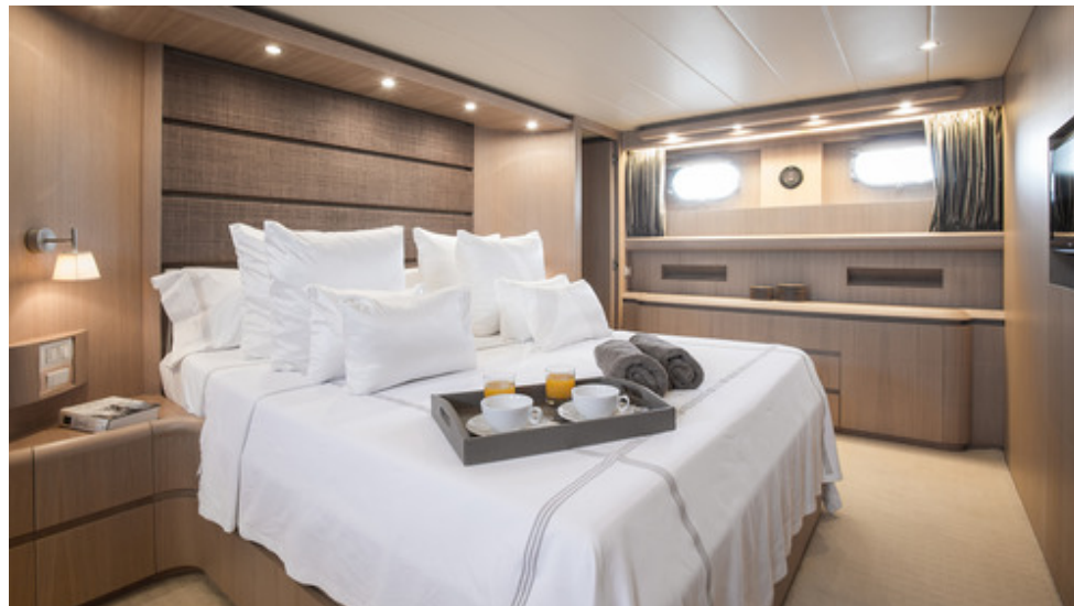
SUBLIME MAR - Master cabin