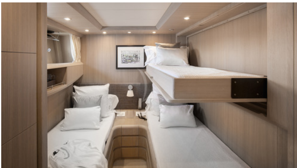
SUBLIME MAR - Twin cabin n°2