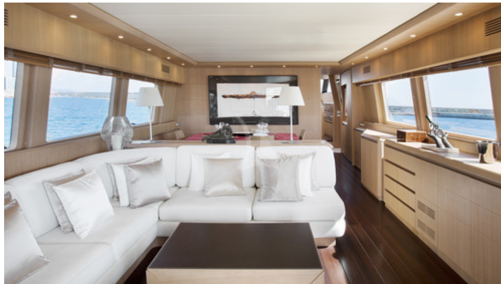
SUBLIME MAR - Salon