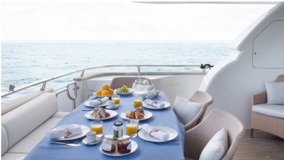
SUBLIME MAR - Aft deck