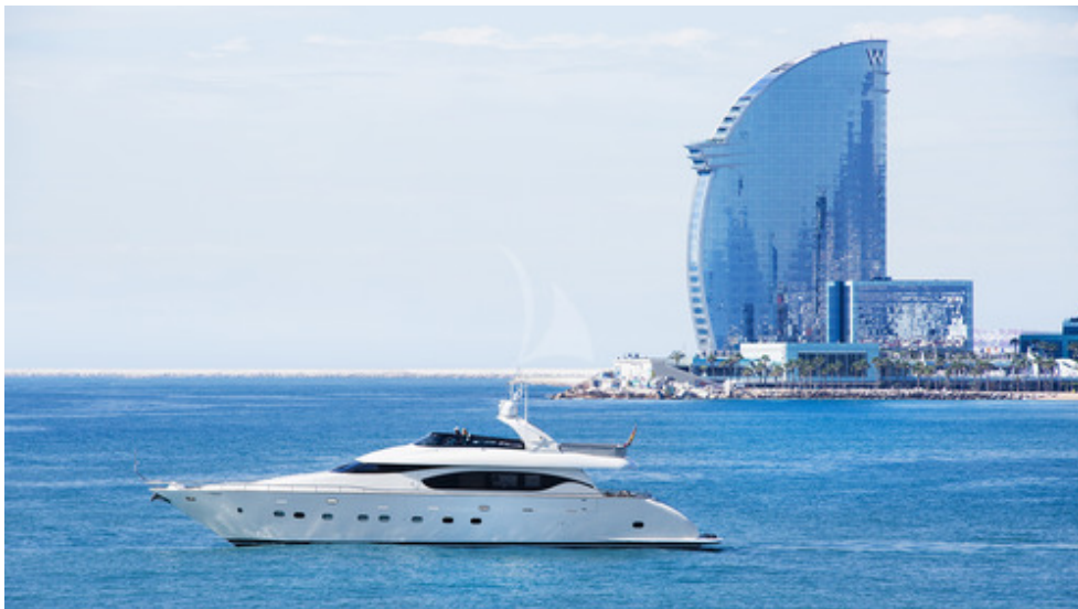
SUBLIME MAR - At anchor