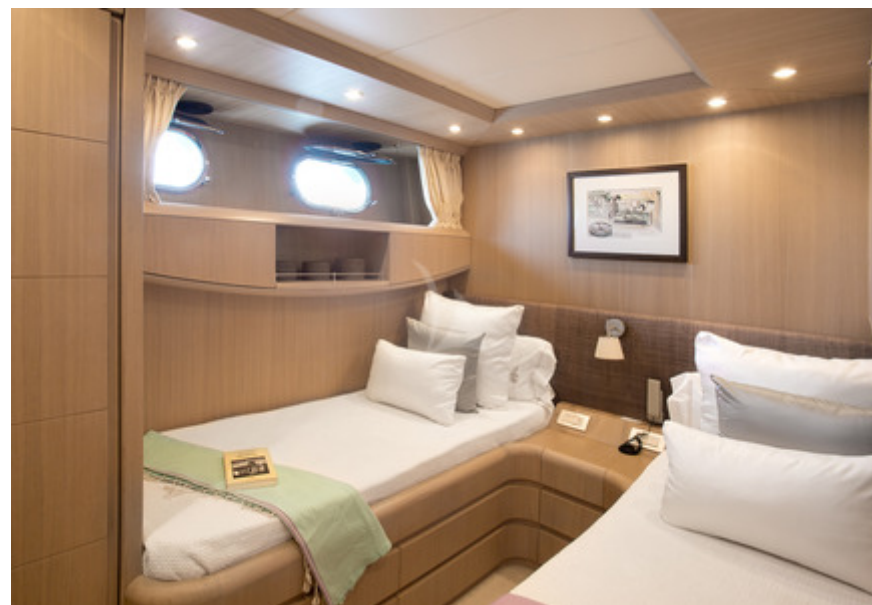
SUBLIME MAR - Twin n°1