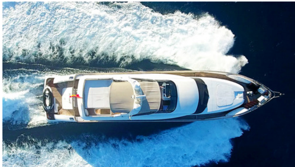
SUBLIME MAR - Aerial View