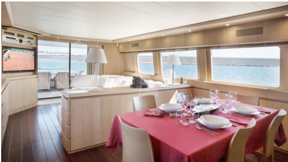
SUBLIME MAR - Dining room