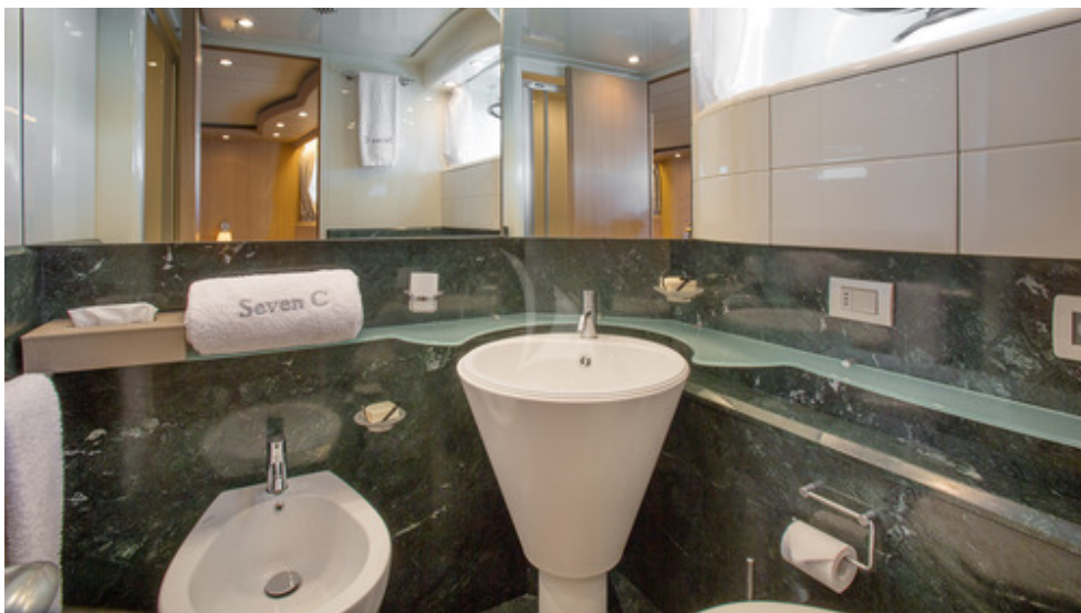
SUBLIME MAR - Twin bathroom