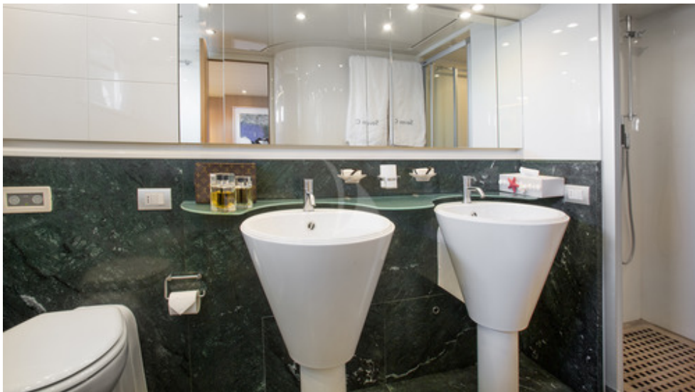
SUBLIME MAR - Master cabin bathroom