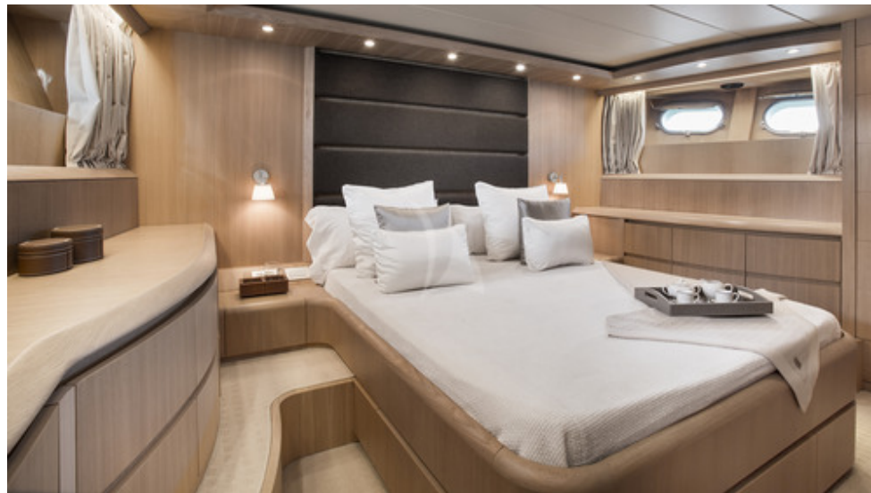
SUBLIME MAR - VIP cabin