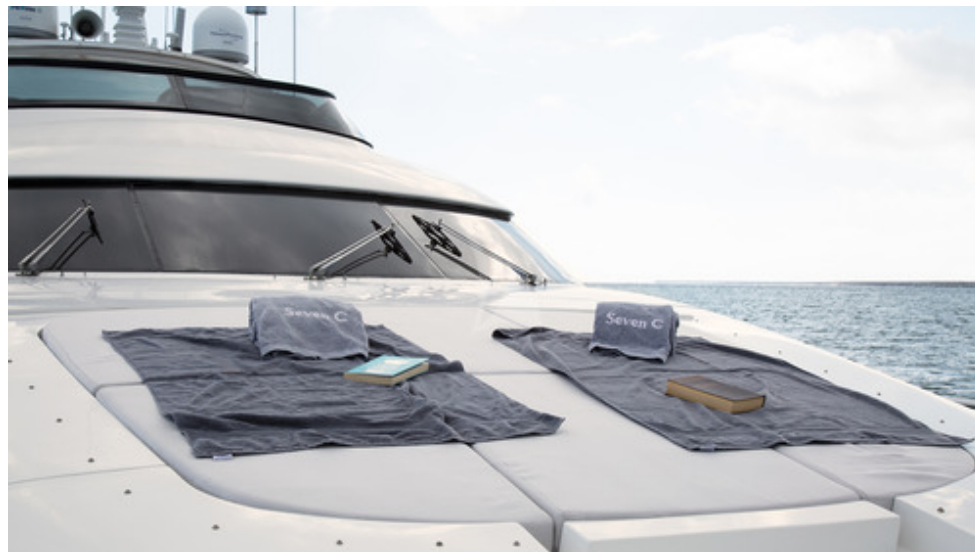
SUBLIME MAR - Foredeck