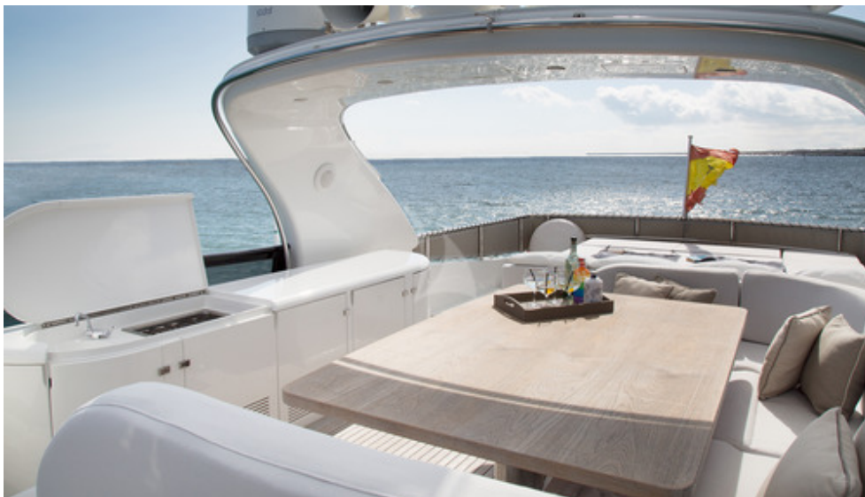
SUBLIME MAR - Upper deck