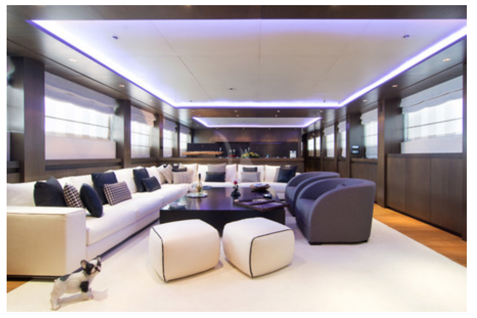
Front Deck Salon