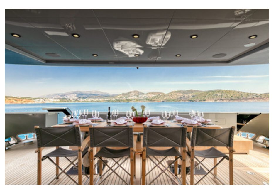
Aft Deck Aft Deck