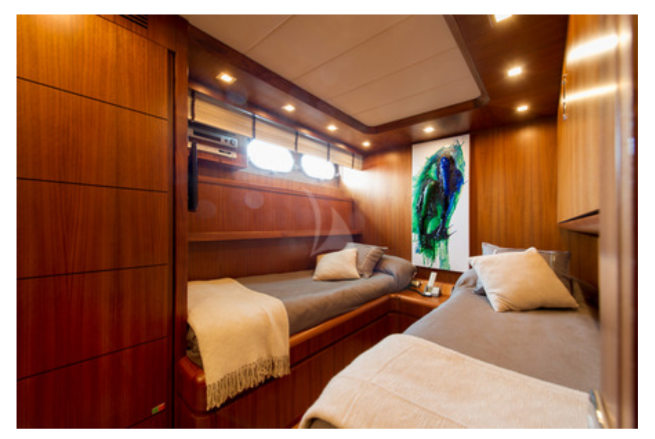
LEX - Twin cabin n°2