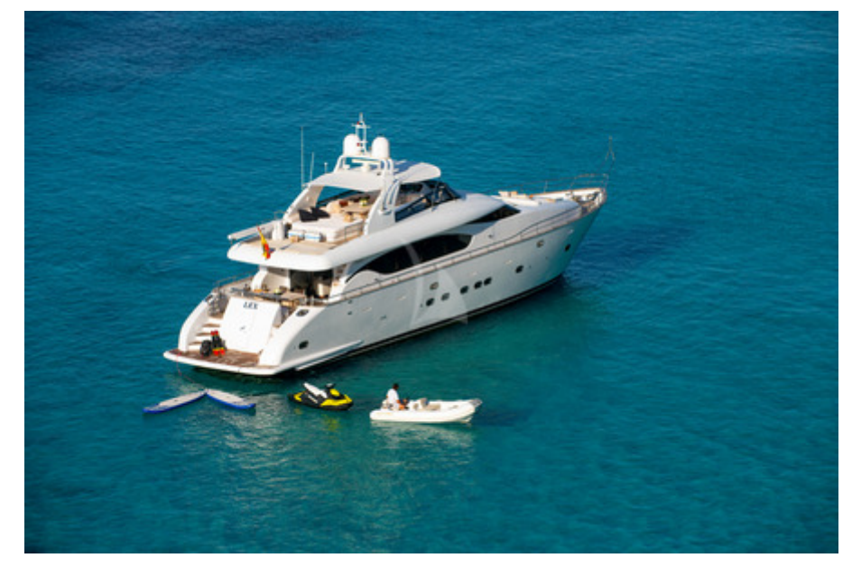
LEX - Toys