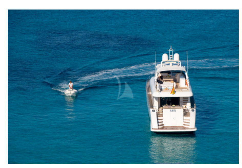
LEX - At anchor