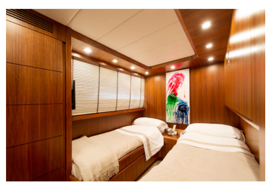
LEX - Twin cabin n°1