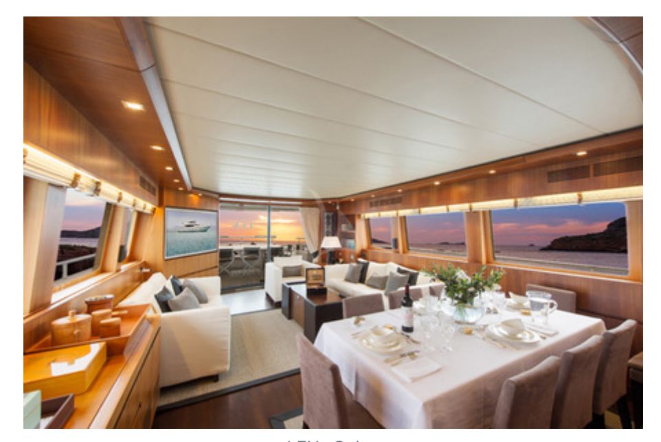
LEX - Salon