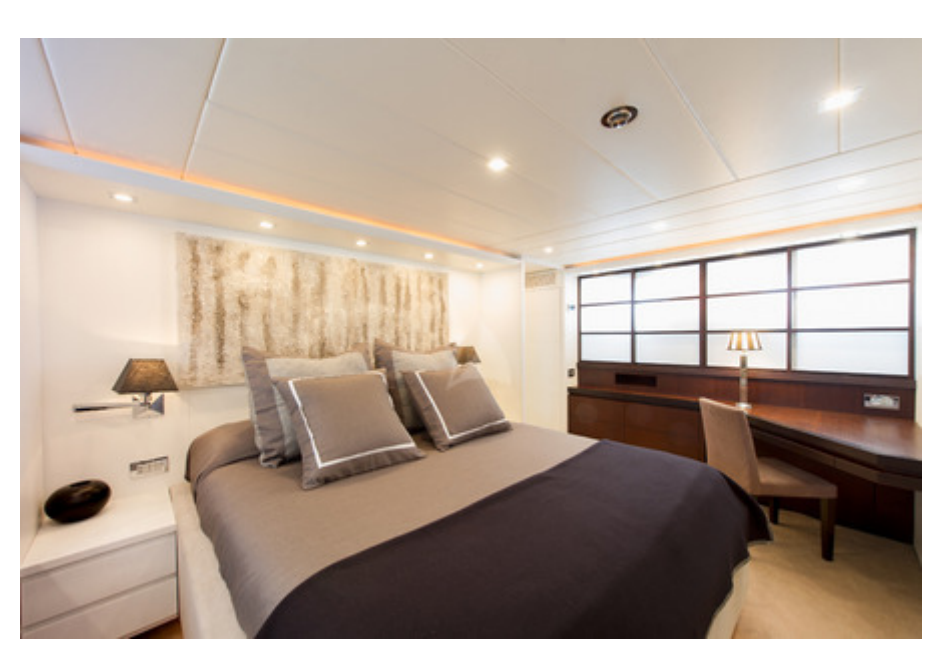
LEX - Master cabin