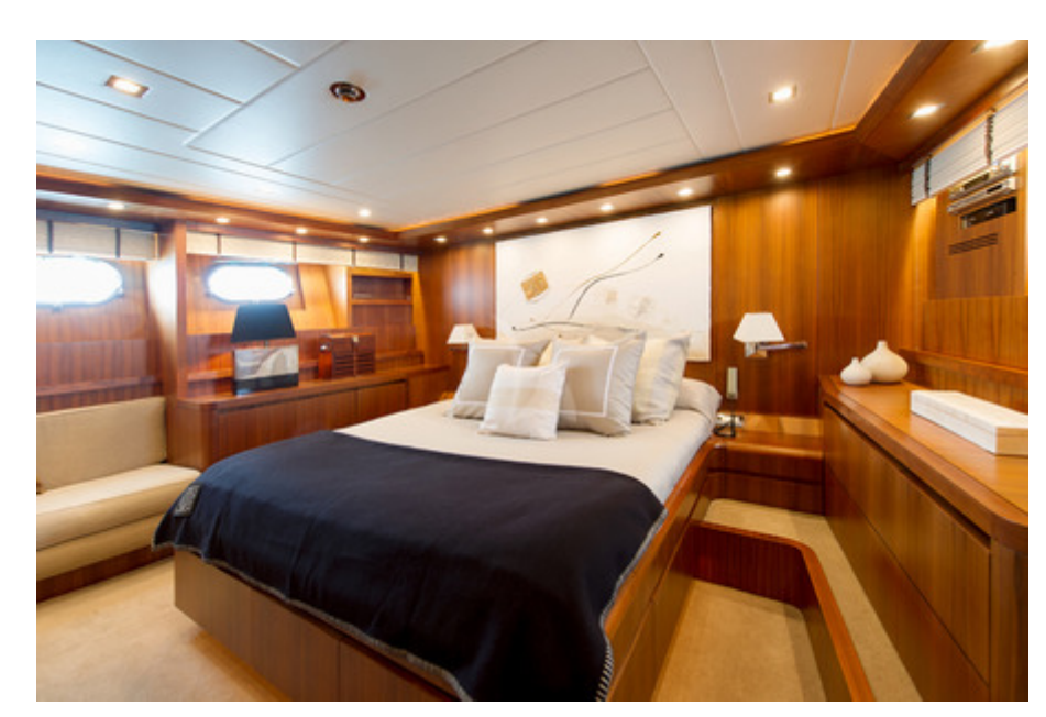
LEX - VIP cabin