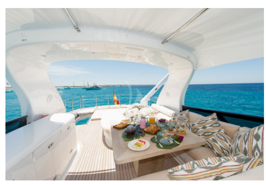
LEX - Flybridge