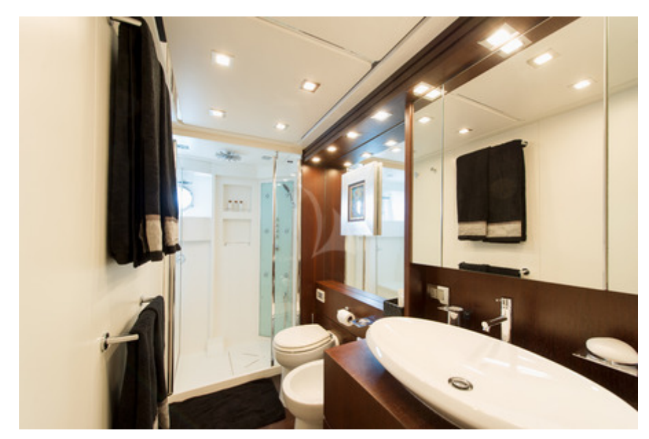
LEX - Master bathroom