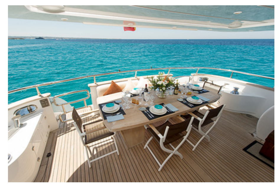
LEX - Aft deck