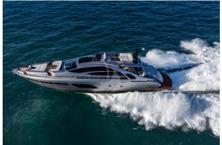
BEYOND - At sailing