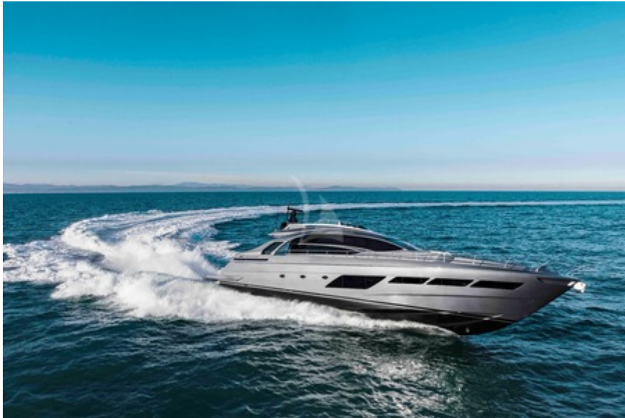
BEYOND - At sailing