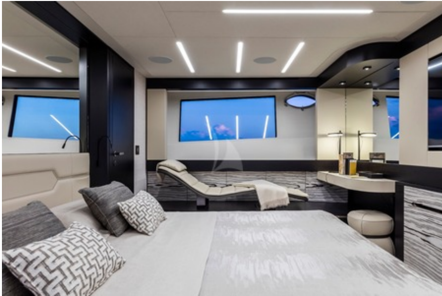
BEYOND - Master cabin