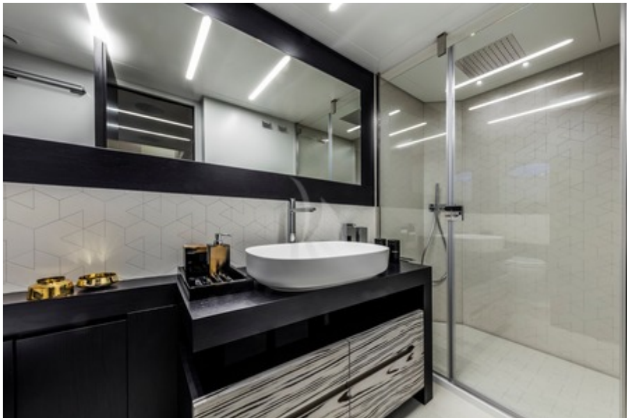
BEYOND - Master cabin bathroom