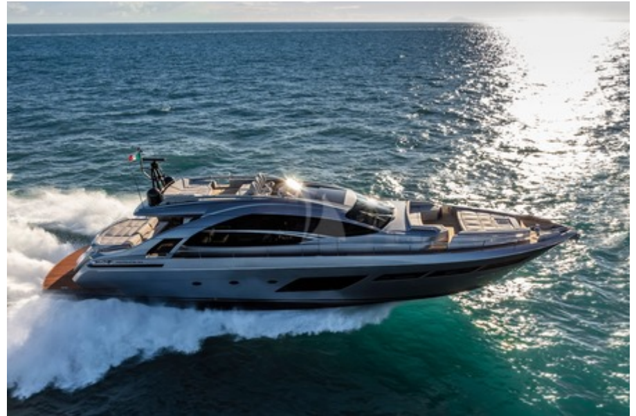
BEYOND - At sailing