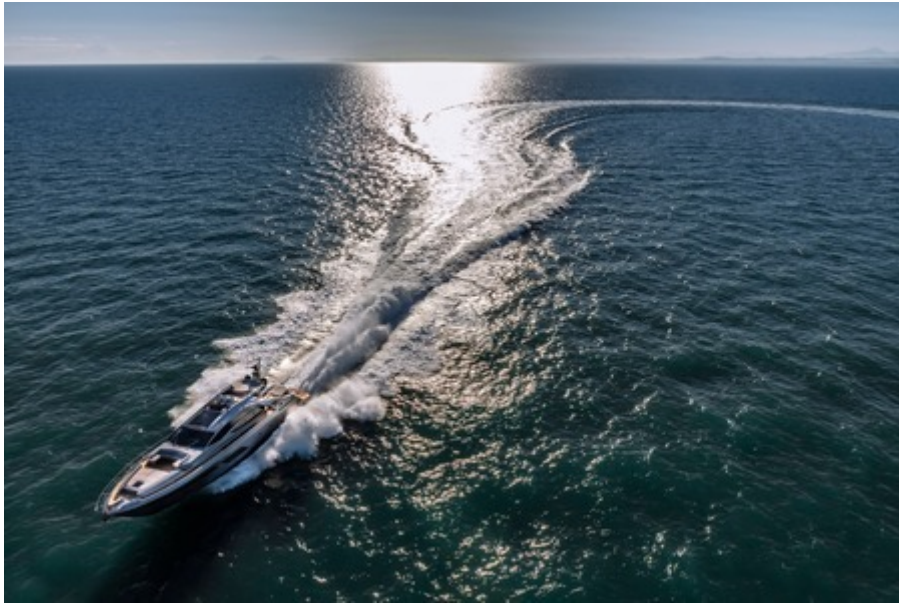
BEYOND - At sailing