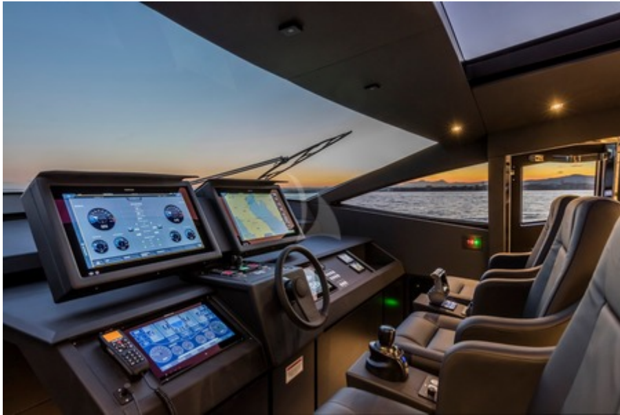
BEYOND - Cockpit