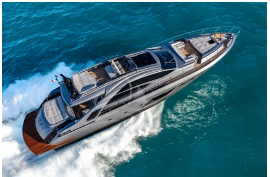
BEYOND - At sailing