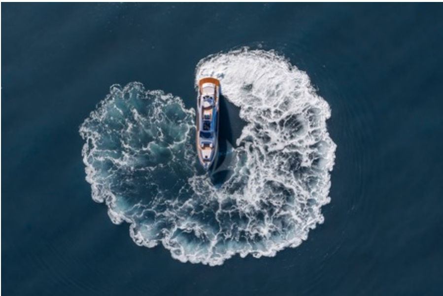
BEYOND - At sailing