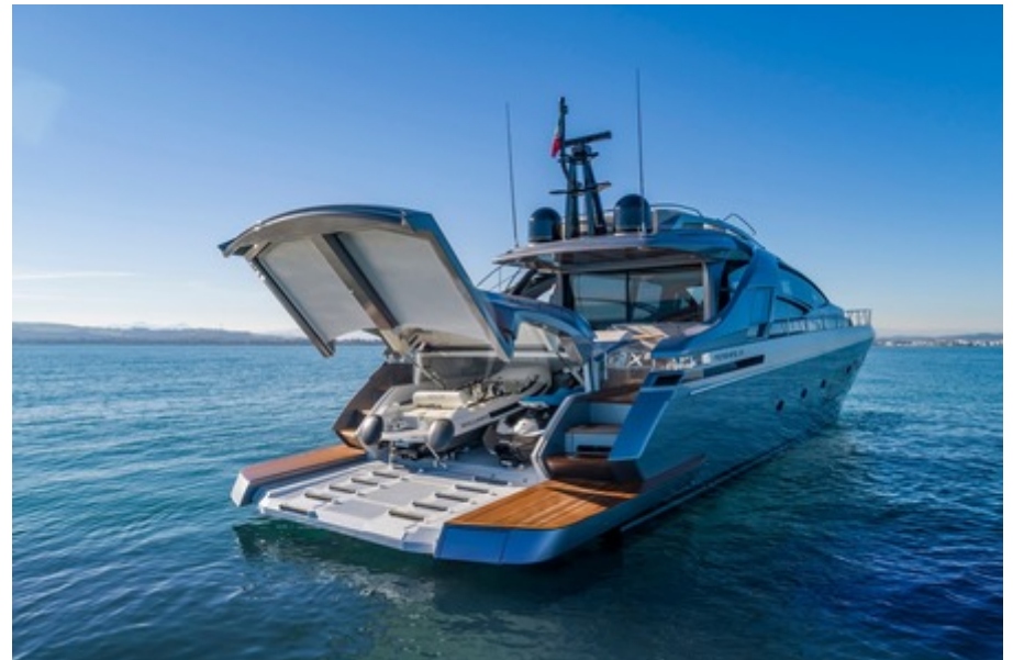
BEYOND - Stern