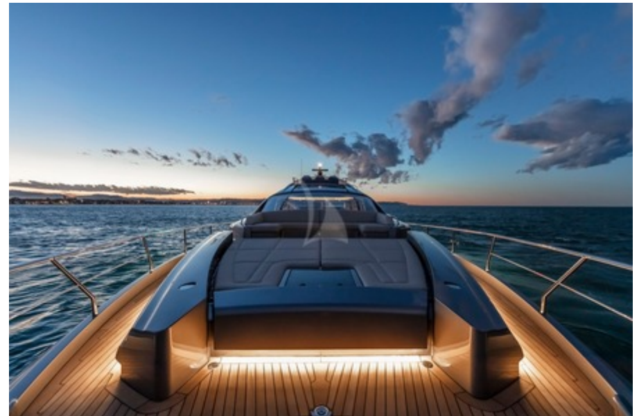
BEYOND - Bow