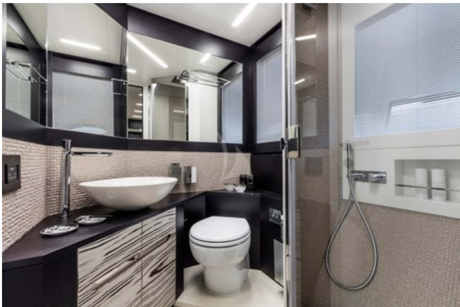
BEYOND - VIP cabin bathroom