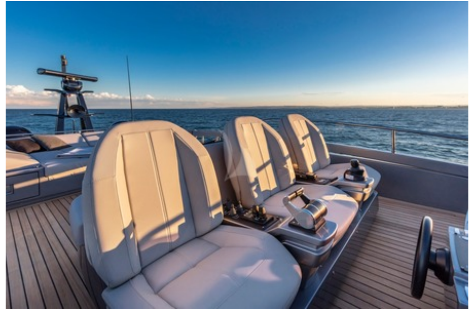
BEYOND - Flybridge