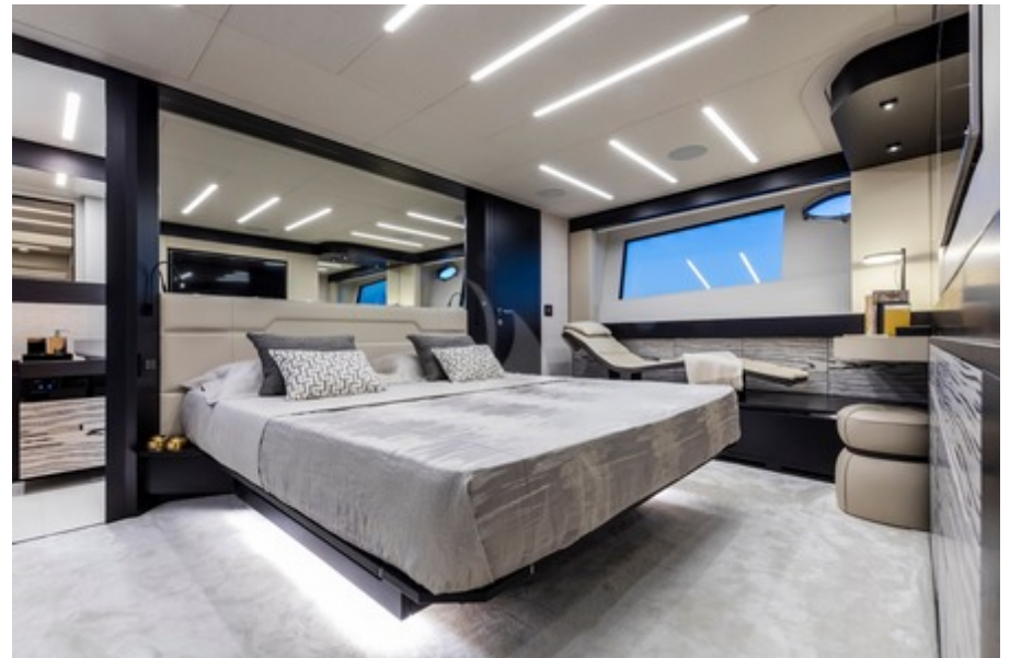
BEYOND - Master cabin