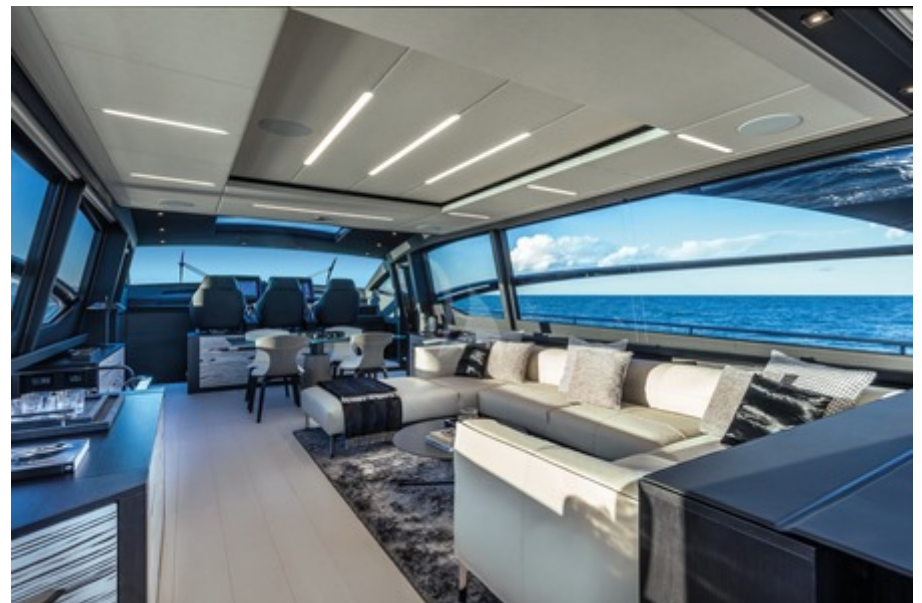
BEYOND - Main salon