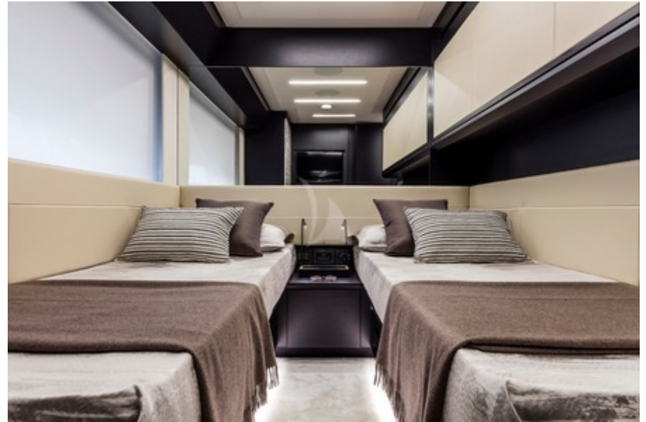
BEYOND - Twin cabin