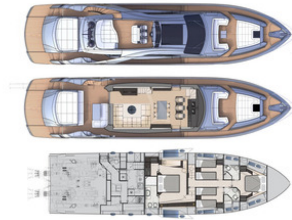
BEYOND - Layout