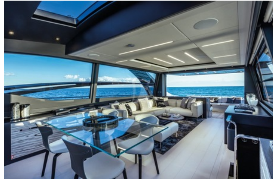
BEYOND - Main salon table