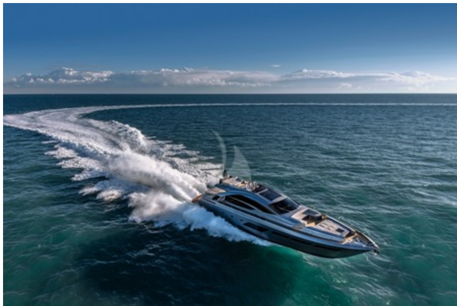
BEYOND - At sailing