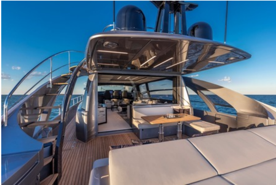
BEYOND - Main entrance