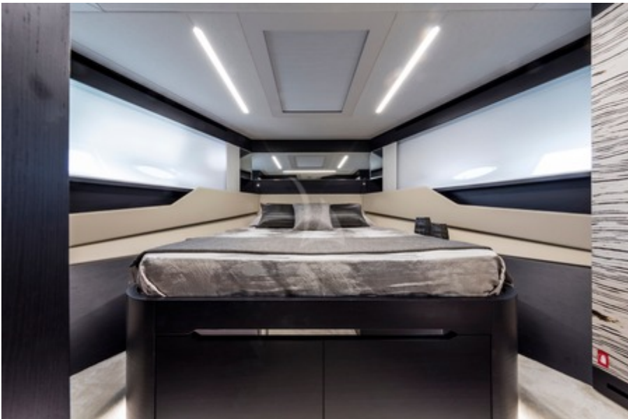
BEYOND - VIP cabin