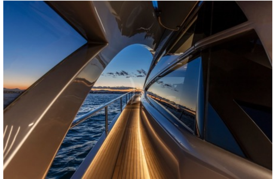
BEYOND - Exterior detail