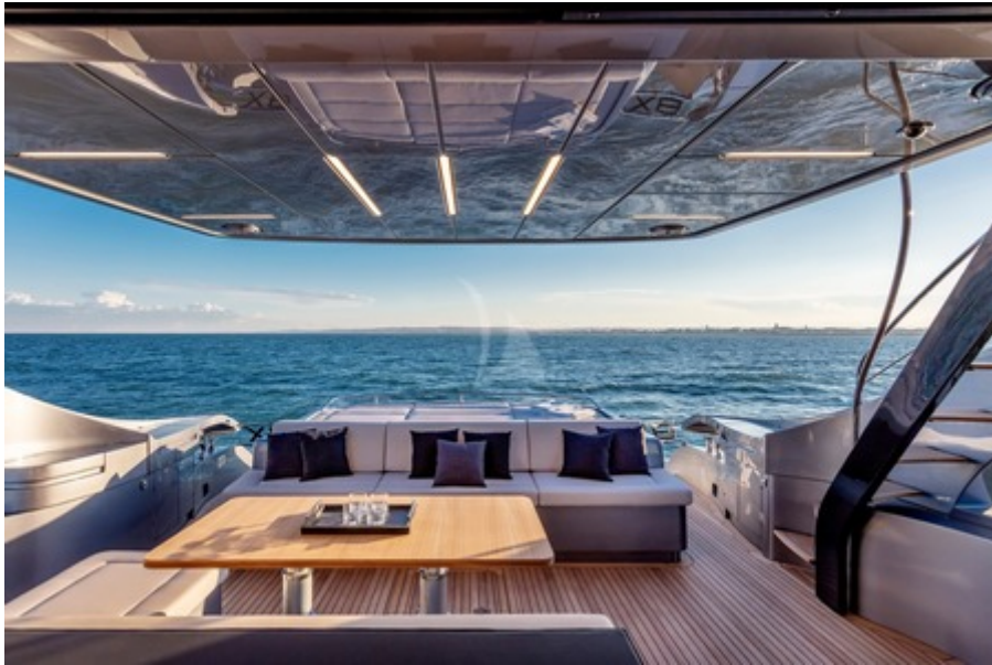
BEYOND - Exterior tale