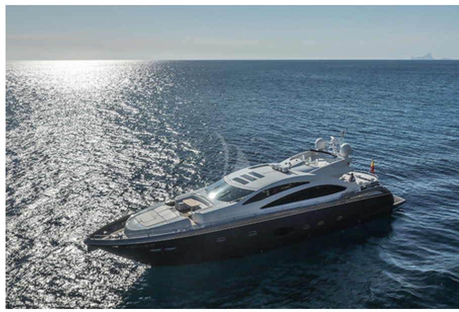
ALVIUM - At anchor