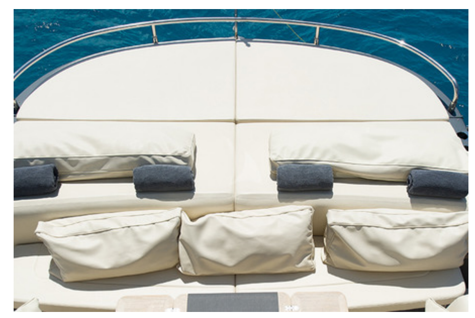
ALVIUM - Aft deck solarium