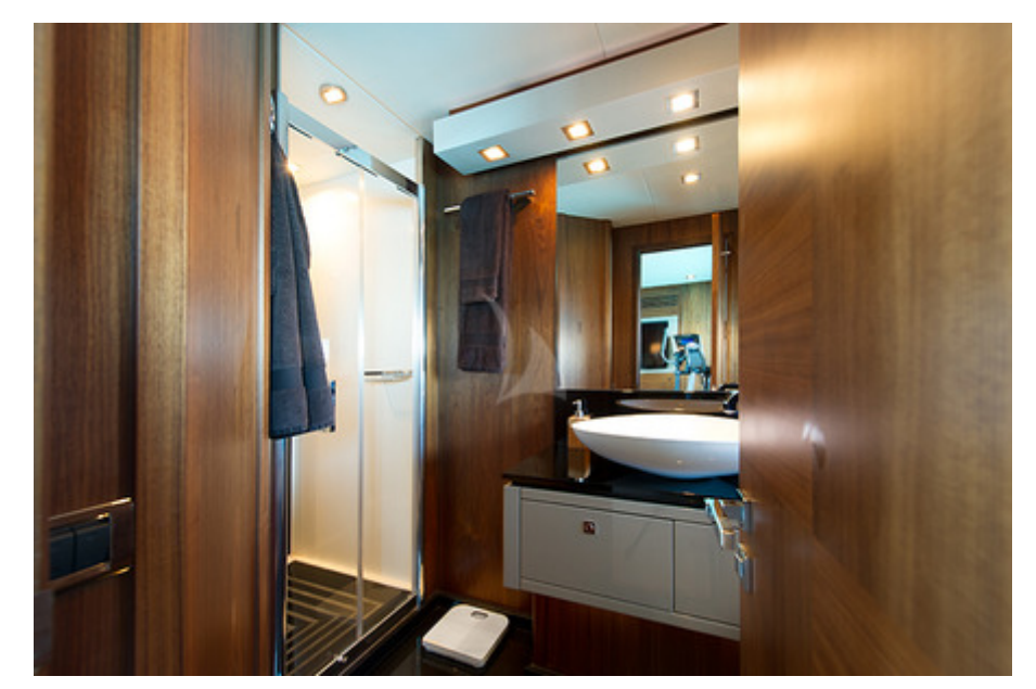
ALVIUM - Master cabin bathroom