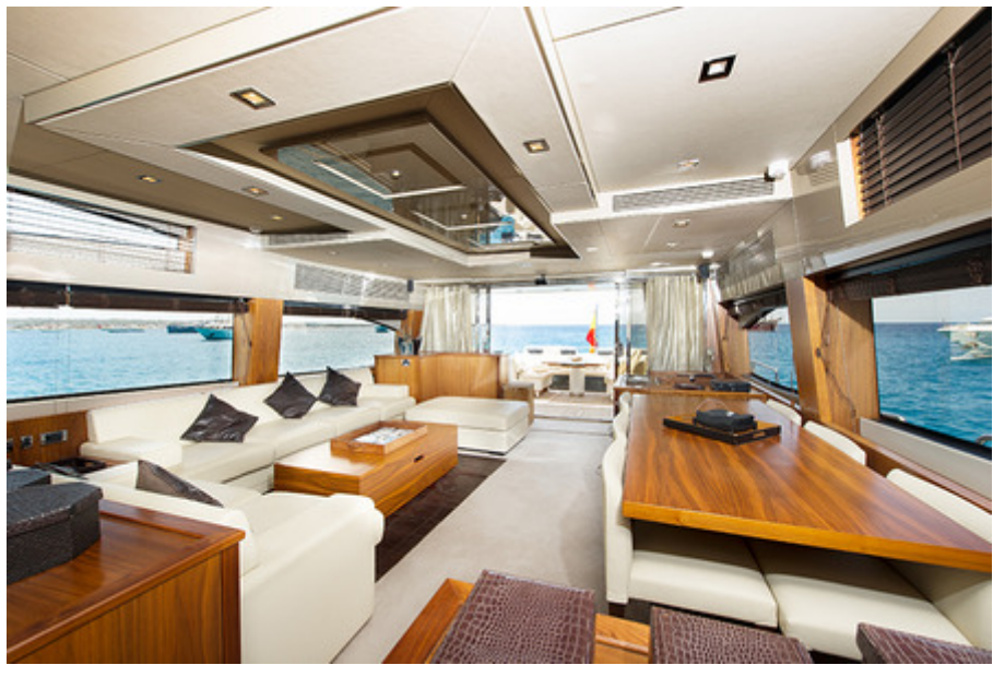
ALVIUM - Salon