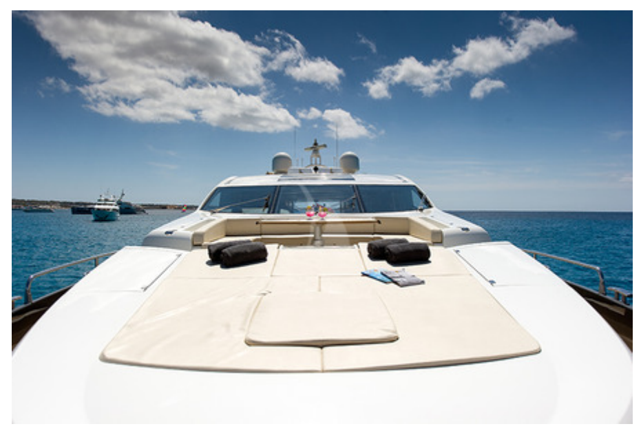
ALVIUM - Foredeck