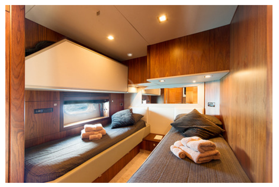
ALVIUM - Twin cabin nº1