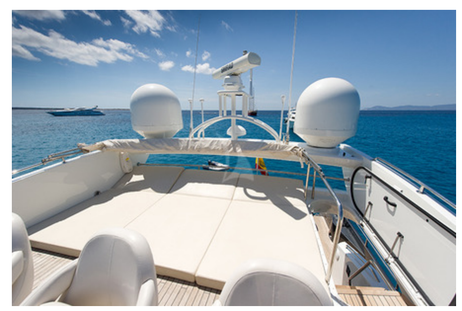
ALVIUM - Sporty fly