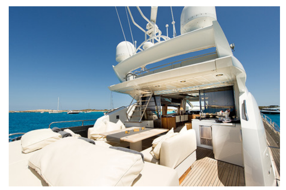
ALVIUM - Aft deck