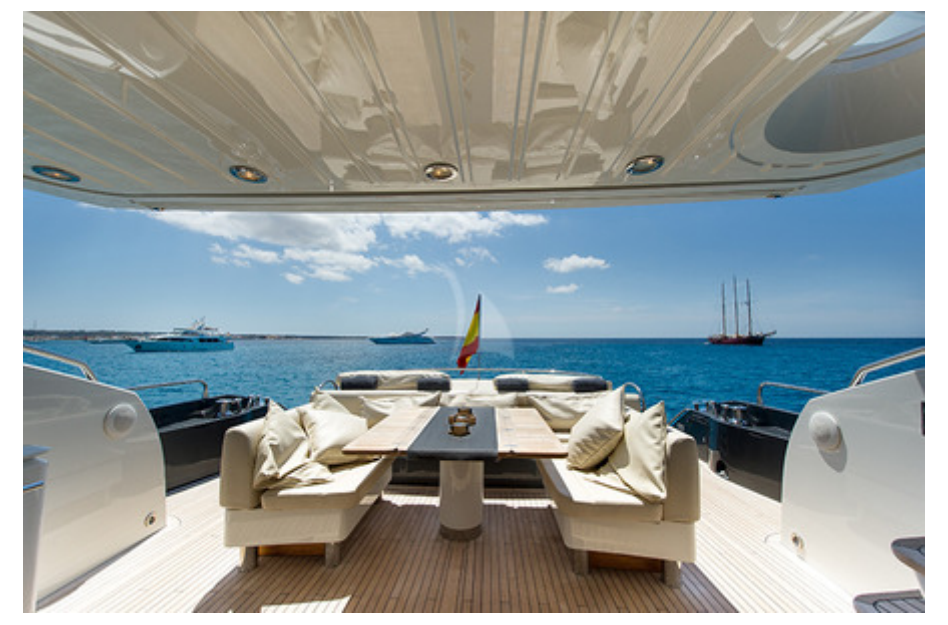
ALVIUM - Aft deck table